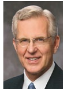
By Elder D. Todd Christofferson