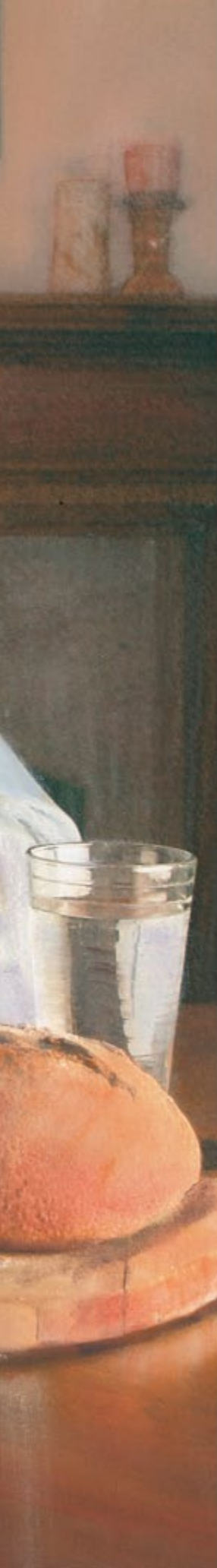
ILLUSTRATIONS BY DIANE HAYDEN