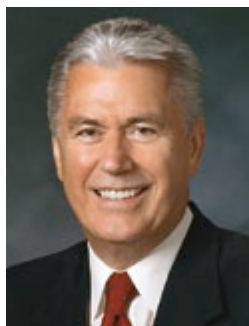
By President Dieter F. Uchtdorf Second Counselor in the First Presidency