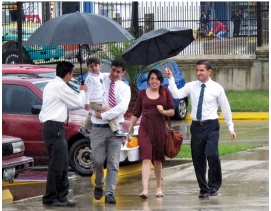
Guatemala City, Guatemala

Therefore, my dear brothers and sisters—my dear friends—please, first