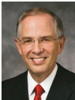
By Elder Neil L. Andersen