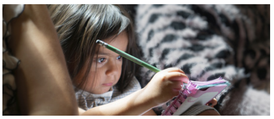
San Bernardo, Santiago, Chile

But we were companions as young missionaries in England in the early 1960s, and I had a great love for him. I considered the experience a tender mercy for me. In recent years, I have wondered if the Lord was preparing me to be junior in the Twelve to an incredible missionary companion who was my junior companion when we were young missionaries. I sometimes warn young missionaries to be kind to their junior companions