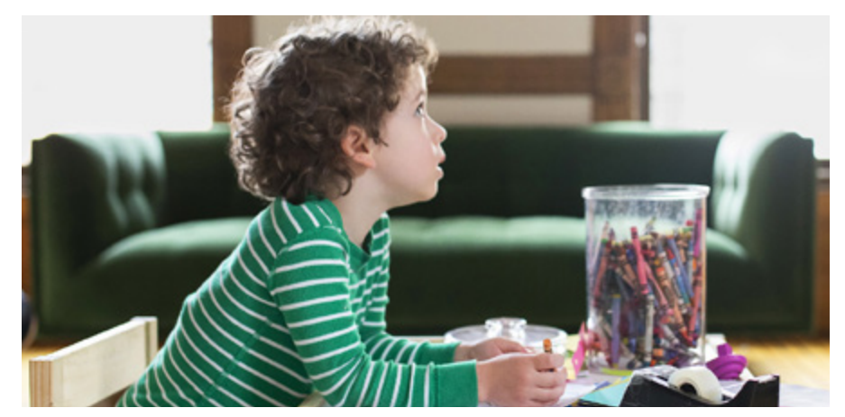
New York City, New York, USA

It means that you and your family can be sealed together forever! It means that because you have been baptized by one who has authority from Jesus Christ and have been confirmed a member of His Church, you can enjoy the constant companionship of the Holy Ghost. He will guide and protect you. It means you will never be left comfortless or without access to the power of God to help you. It means that priesthood power can bless you as you receive essential ordinances and make covenants with God and keep them. What an anchor to our souls are these truths, especially during these times when the tempest is raging.