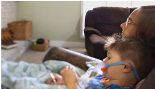
Sandy, Utah, USA