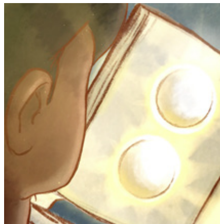
Spiritual memories are like luminous stones that brighten the road ahead.