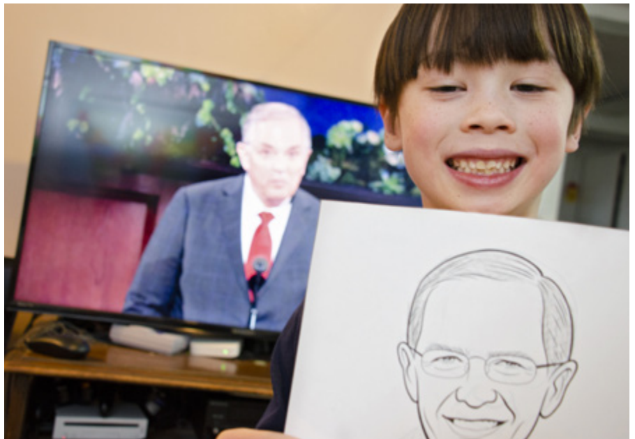
Salt Lake City, Utah, USA

First Vision: “I had actually seen a light, and in the midst of that light I saw two Personages, and they did in reality speak to me; and though I was hated and persecuted for saying that I had seen a vision, yet it was true. . . .