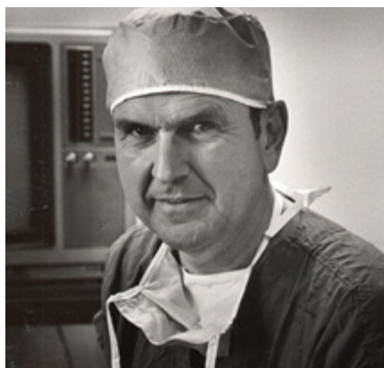
Dr. Russell M. Nelson

“After relieving the obstruction of the first valve, we exposed the second valve. We found it to be intact but so badly dilated that it could no longer function as it should. While examining this valve, a message was distinctly impressed upon my mind: Reduce the circumference of the ring. I announced that message to my assistant. ‘The valve tissue will be sufficient if we can effectively reduce the ring toward its normal size.’