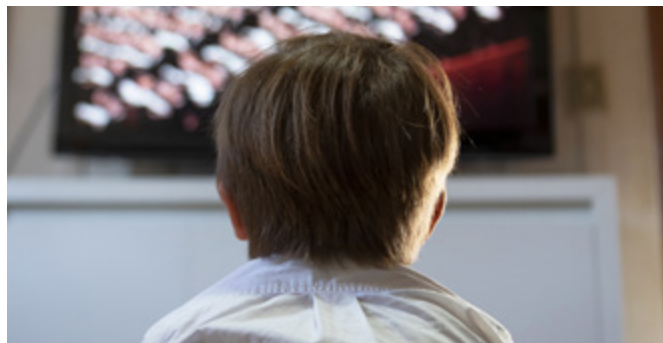
Curitiba, Paraná, Brazil