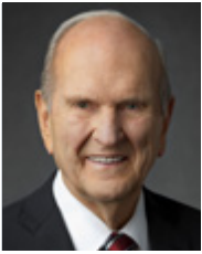
By President Russell M. Nelson President of The Church of Jesus Christ of Latter-day Saints