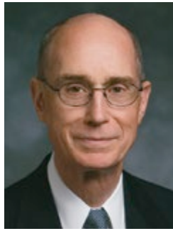
By President Henry B. Eyring First Counselor in the First Presidency

Scan this QR code or visit lds.org/go/Apr14Conf10 to watch this talk or to find a shareable picture quote and short video from the talk.