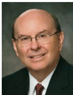
By Elder Quentin L. Cook Of the Quorum of the Twelve Apostles