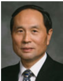
By Elder Koichi Aoyagi Of the Seventy