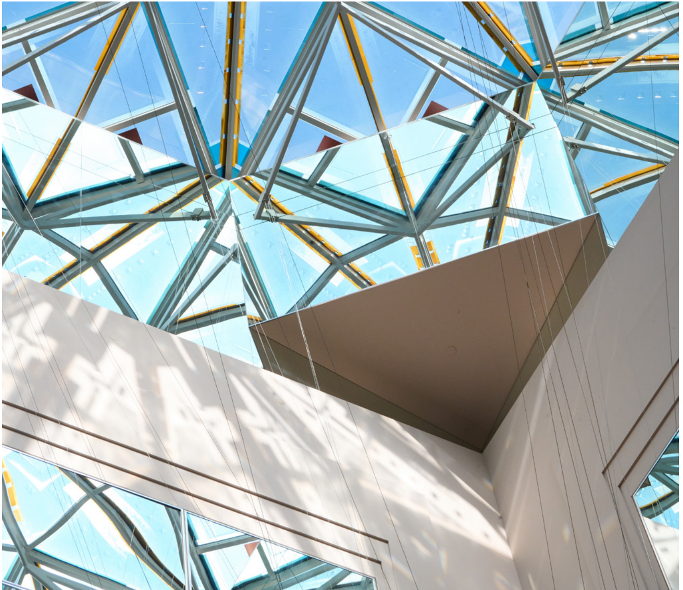
Skylight and landscaping view (left) at the Conference Center in Salt Lake City

While in this irrational state, our son believed that the only action left was to take his own life. It took the Holy Ghost and a legion of angels on both sides of the veil to save him.