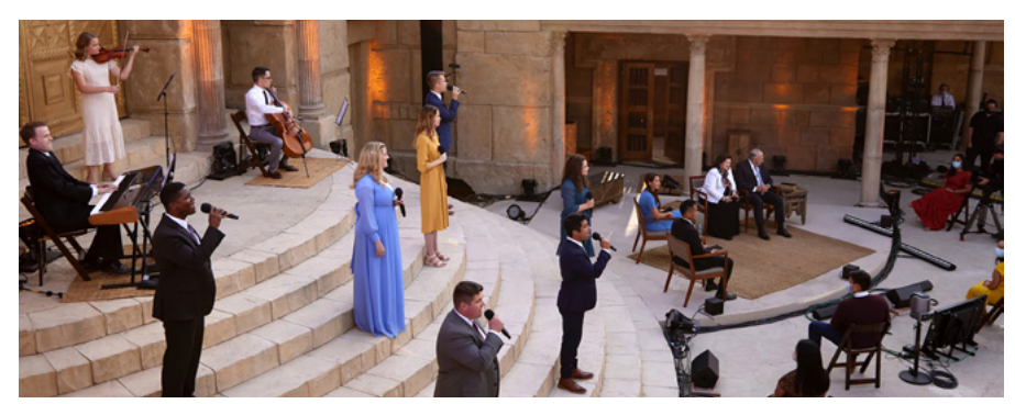
Miracles can come as answers to prayer, like the miracle we experienced at a worldwide Face to Face event in Goshen, Utah.

In latter-day scripture it is written, "For I, the Lord, have put forth my hand to exert the powers of heaven; ye cannot see it now, yet a little while and ye shall see it, and know that I