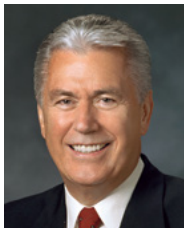
By Elder Dieter F. Uchtdorf Of the Quorum of the Twelve Apostles