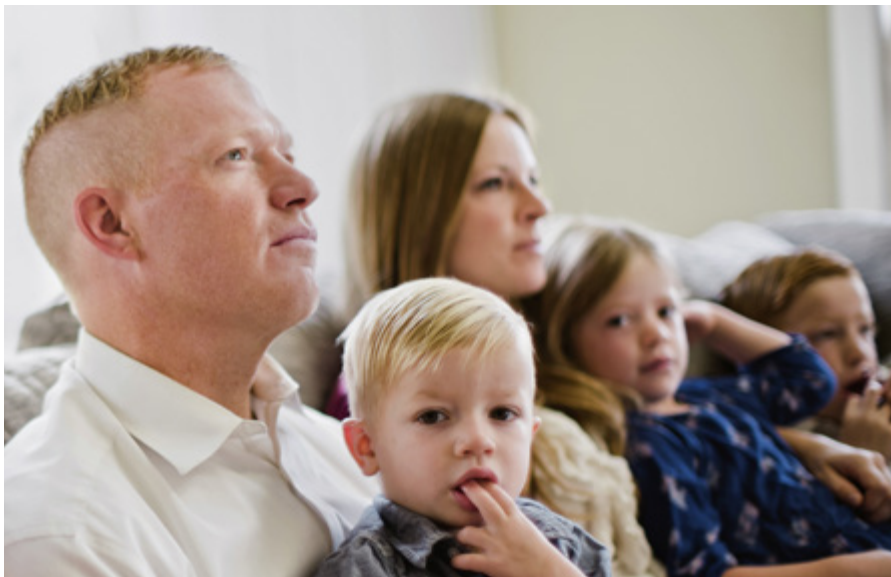
Orem, Utah, USA

During this time of restricted gathering that makes regular temple attendance impossible, I have actually made a point to continue to study and learn more about the power of God that comes to us as we make and keep temple covenants. As promised in the dedicatory prayer of the Kirtland Temple, we leave the temple armed with God's power. 16 There is no expiration date associated with the power God bestows upon those who make and keep temple covenants, nor is there a restriction from accessing that power during a pandemic. His power diminishes in our lives only if we fail to keep our covenants and do not live in a way that allows us to continually qualify to receive His power.