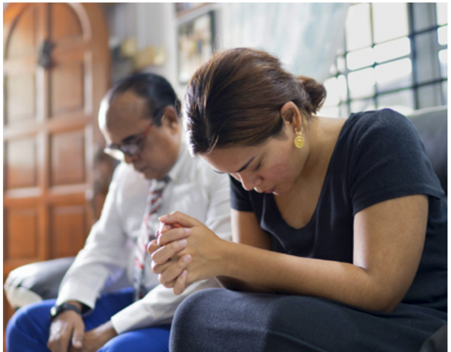
Kuala Lumpur, Malaysia

In an effort to save our home from burning, I reached behind the