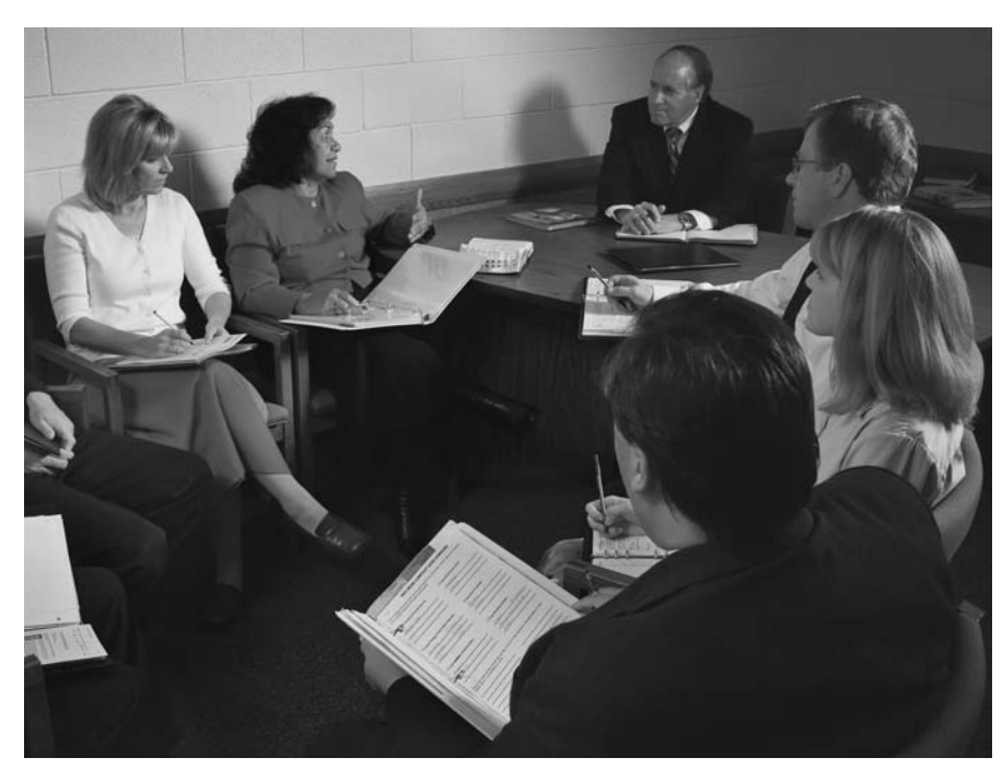
When a ward council or a presidency meets, they should consider, "How can we support the family?"

We need to add to that the caution that if we make more family time available, parents have to take more responsibility in making sure that it doesn't just increase sports, television viewing, individual athletic activities, or participation in many, very good community activities for children. We are not trying to hobble the Church in competing with other activities. We are trying to discipline the use of Church meetings and Church activities in favor of the family. And the family has got to fill that vacuum instead of inviting others in to fill it.