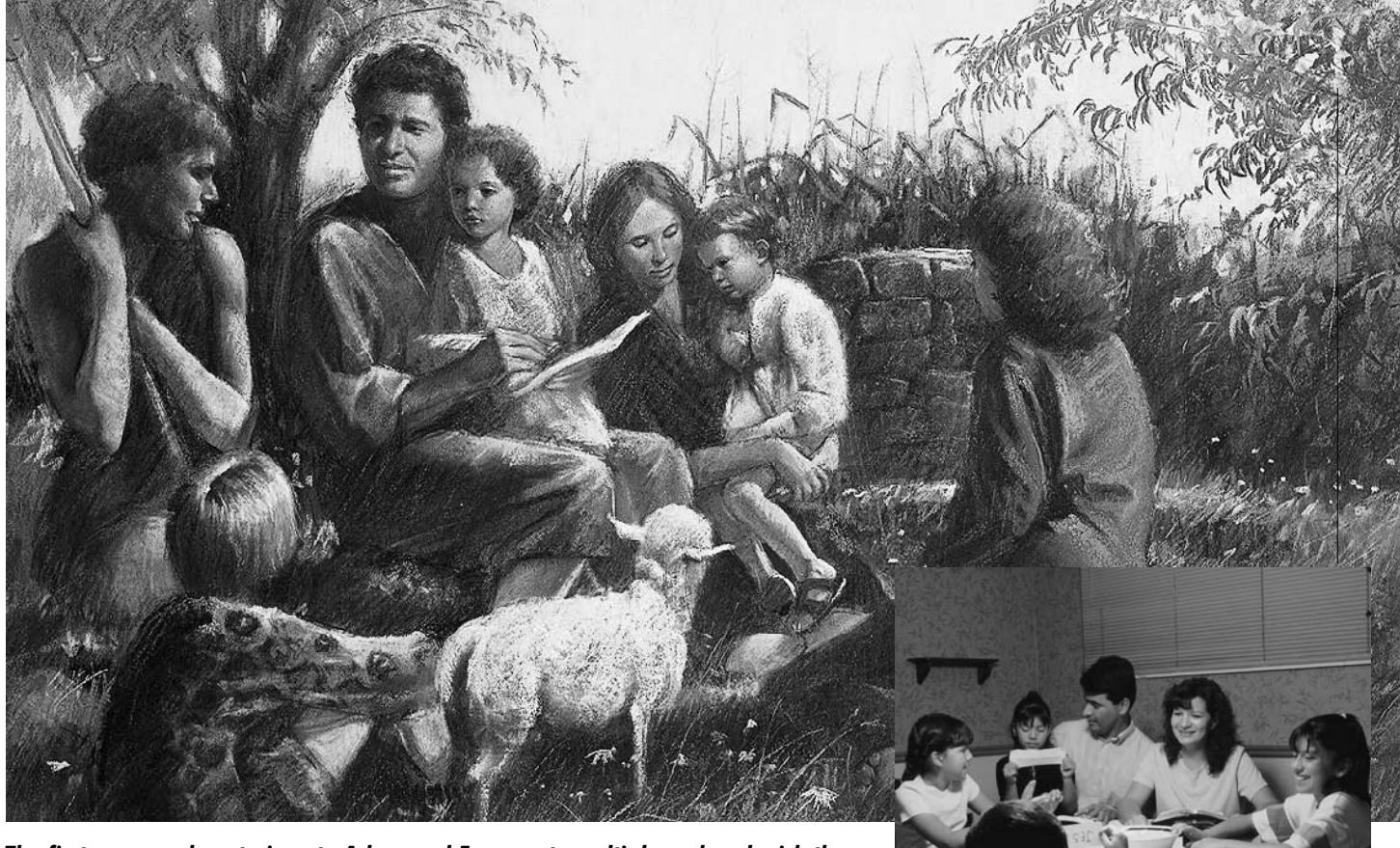
The first commandment given to Adam and Eve was to multiply and replenish the earth. That pattern has continued through all human history.

were given to them in their bodies. And that pattern would continue through all of the annals of human history.