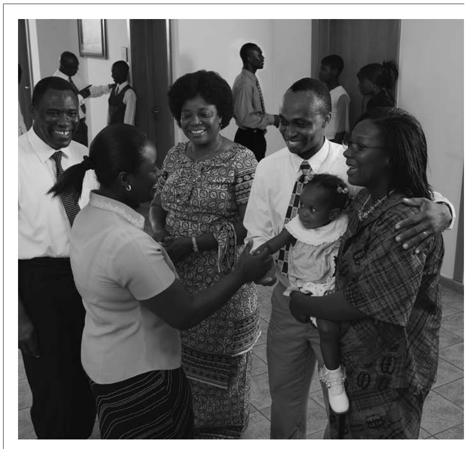
It's not easy to establish a family in this life and raise children. But in the Church you find the help that you need.

protected, and that's within the ordinances and the doctrines of the gospel of Jesus Christ. Live the gospel, and you're going to be all right.