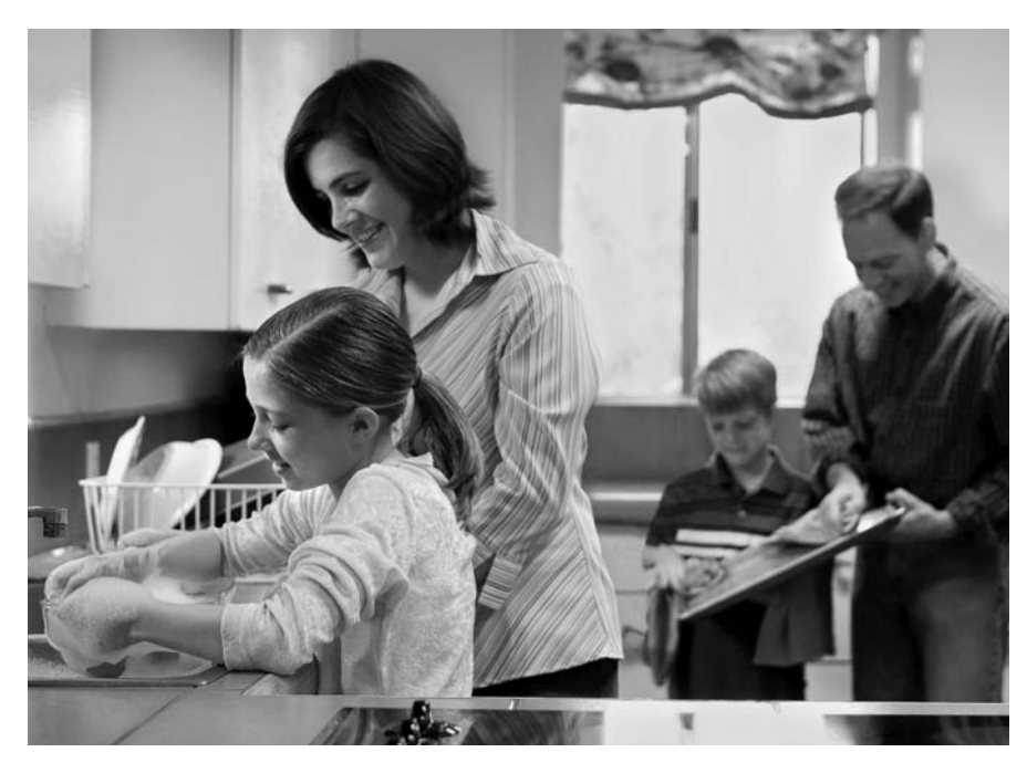
In their sacred responsibilities, fathers and mothers are obligated to help each other as equal partners.

in order to conform to what we know to be true?" They built their home on those Christlike principles that you mentioned. What did the Savior teach? How do we treat each other? Good manners, kindness, respect.