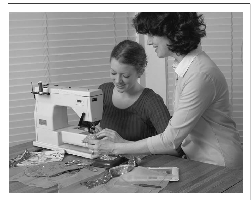
We can agree on the pattern as it comes from God, and we can strive for its realization the best way we can.

I think you can see my point and hers. We are bound to be in trouble if a shirt is made from a shirt that was made from a shirt. A mistake or two in the first product—inevitable without a pattern-gets repeated and exaggerated, intensified, more awkward, the more repetitions we make, until finally this thing I'm to wear to school just doesn't fit. One sleeve's too long. The other's too short. One shoulder seam runs down my chest. The other runs down my back. And the front collar button fastens behind my neck. I can tell you right now that such a look is not going to go over well in the seventh grade.