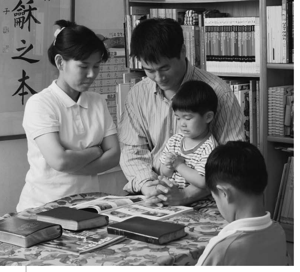
As we pray with our families each day, we will help to provide the protection we all so desperately need in today's world.

Margaret Thatcher, when she was prime minister of Great Britain, expressed this profound philosophy: "The family is the building block of society. It is a nursery, a school, a hospital, a leisure centre, a place of refuge and a place of rest. It encompasses the whole of the society. It fashions our beliefs; it is the preparation for the rest of our life."<sup>2</sup>