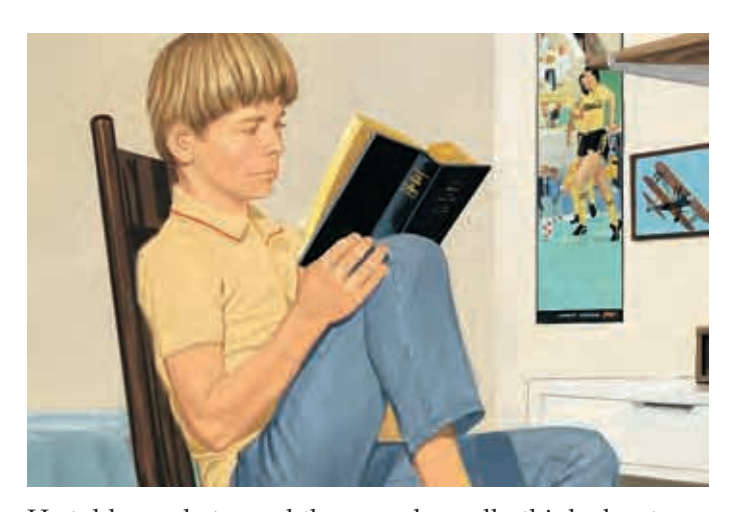
He told people to read the records, really think about them, and then ask Heavenly Father if they are true. *Moroni 10:3-4*