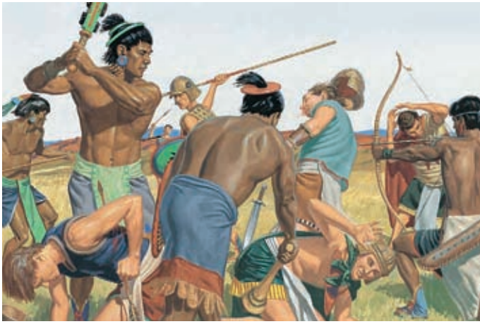
The Nephites had become so wicked, though, that the Lord would not help them. Mormon 2:26