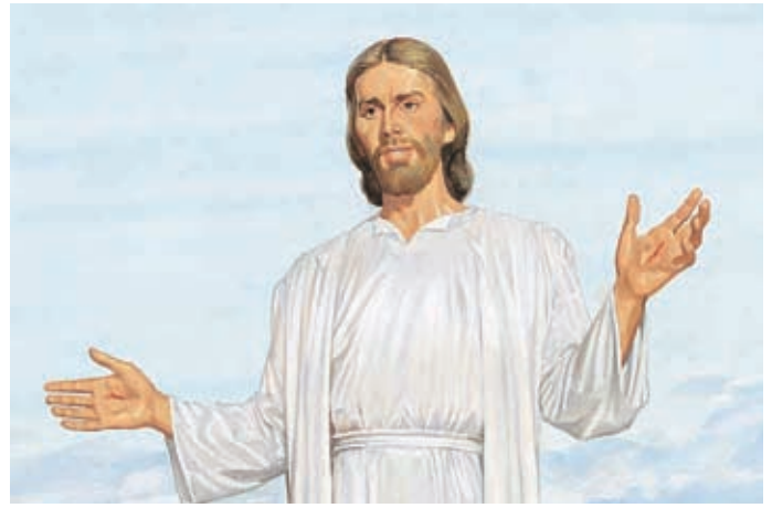
Mormon had tried to teach the Nephites the truth. He had told them how important it was to have faith in Jesus Christ. Moroni 7:1, 33, 38