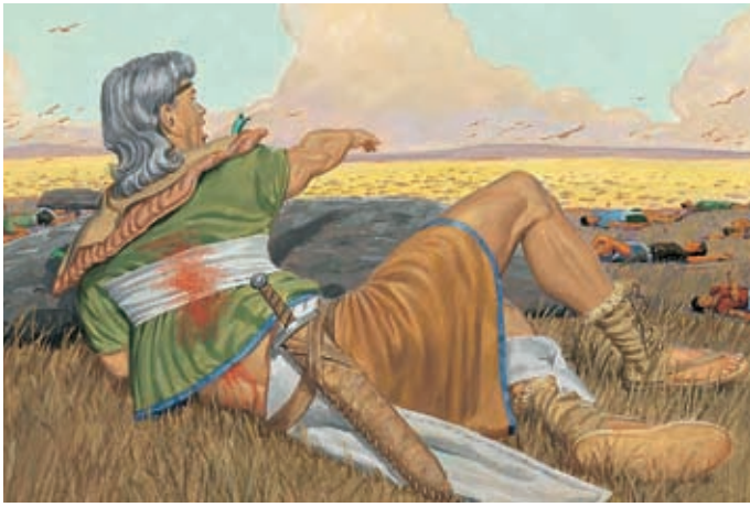
Mormon was sad that so many Nephites had died, but he knew they had died because they had rejected Jesus. Mormon 6:16–18