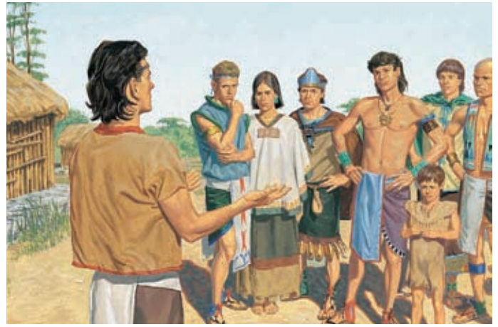
Mormon told the Nephites they would be spared only if they repented and were baptized. But the people refused. Mormon 3:2-3