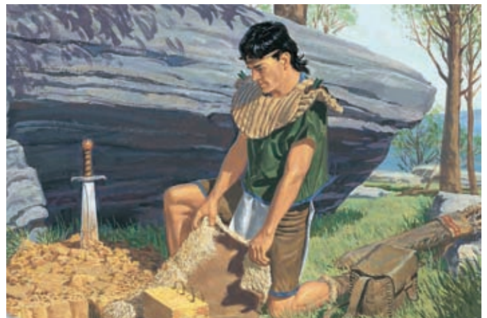
Mormon took all the records from the hill where Ammaron had hidden them and wrote to the people who would one day read the record. Mormon 4:23; 5:9, 12