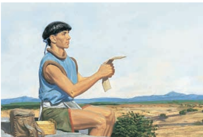
Mormon wrote about the terrible wickedness of the Nephites. He told Moroni to stay faithful in Jesus Christ. Moroni 9:1, 20, 25