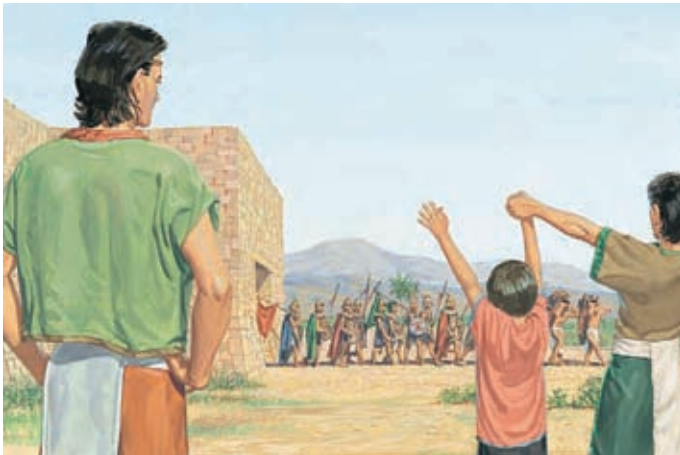
They bragged about their strength, saying they would kill all the Lamanites. Because of the Nephites' wickedness, Mormon refused to lead them any longer. Mormon 3:9-11