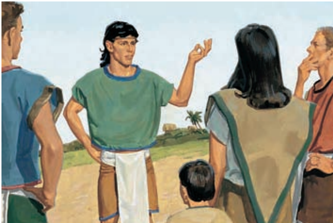
He had tried to teach them to have hope through Jesus Christ's Atonement and to have charity, which is the pure love of Christ. Moroni 7:40–41, 47