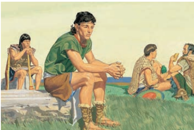
He knew the wicked Nephites would not win the war. They did not repent or pray for the help they needed. Mormon 5:2