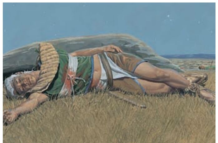
The Lamanites killed Mormon and all the Nephites but Moroni, who finished writing the records. Mormon 8:2–3