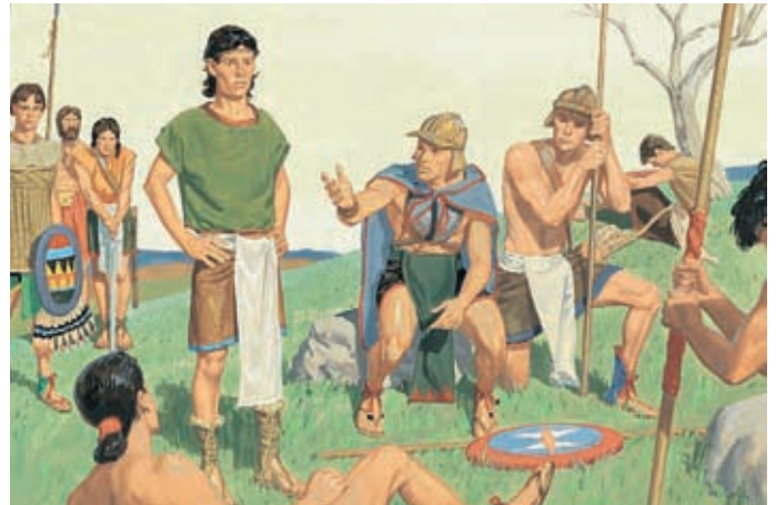
The Lamanites began defeating the Nephites in every battle. Mormon decided to lead the Nephite armies again. Mormon 4:18; 5:1