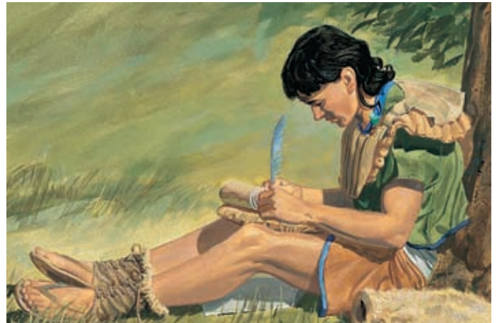
And Mormon had written letters to his son, Moroni, who had also taught the gospel to the Nephites. Moroni 8:1–2