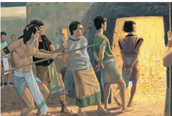
When they were pushed into furnaces and into dens with wild animals, they were also protected by the power of God. 3 Nephi 28:21–22