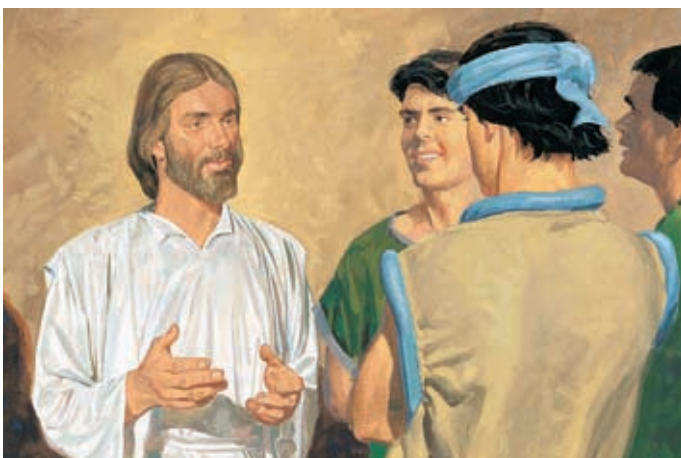
The Savior promised them that they would not suffer pain or sorrow and would not die. They would teach people the gospel until he returned. 3 Nephi 28:7–9