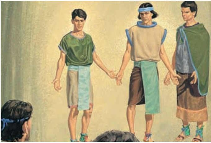
The three disciples were taken to heaven, where they saw and heard many wonderful things. They were better able to understand the things of God. 3 Nephi 28:13, 15