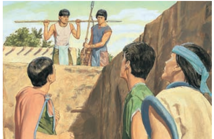
Wicked Nephites threw the three disciples into prison and into deep pits, but God's power helped them escape. 3 Nephi 28:19–20