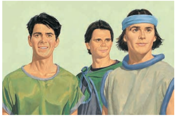
Their bodies were changed so they would not die. 3 Nephi 28:15