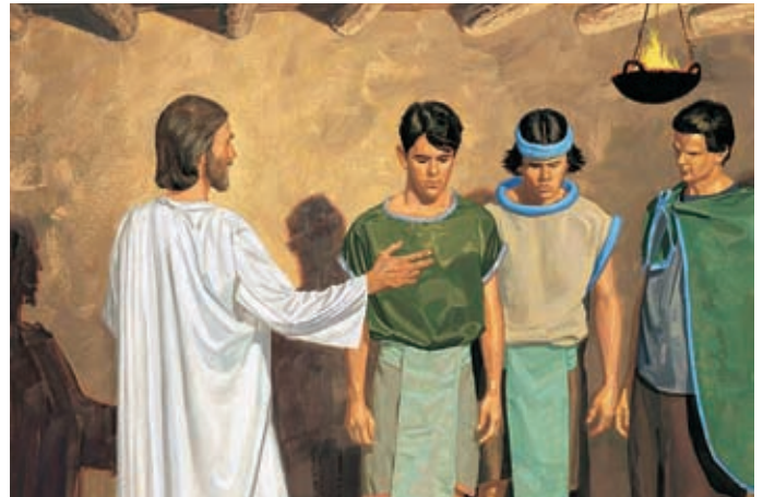
The other three disciples did not dare ask for what they wanted, but Jesus knew. They wanted to stay on the earth and teach the gospel until Jesus came again. 3 Nephi 28:5–6, 9