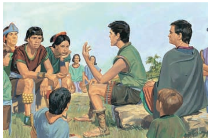
The three disciples continued to preach the gospel of Jesus Christ to the Nephites. They are still preaching his gospel. 3 Nephi 28:23, 27–29