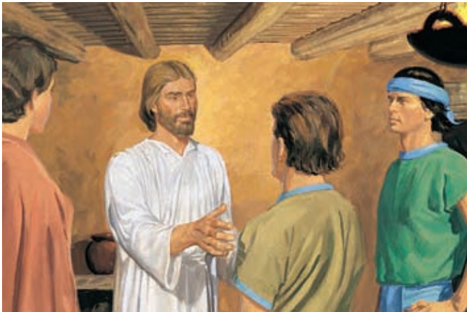
Jesus promised them that when they were 72 years old, they would go to him in heaven. 3 Nephi 28:3