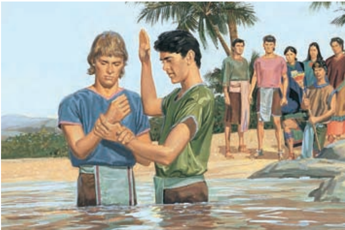
The three disciples returned to earth and began preaching and baptizing. 3 Nephi 28:16, 18