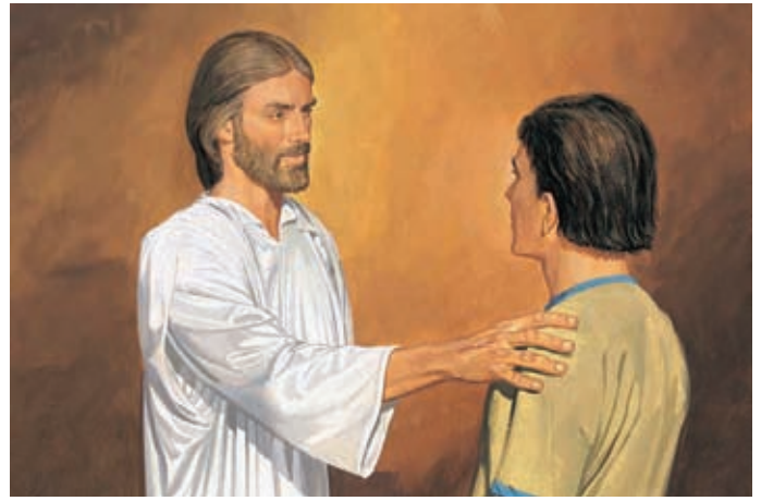
Jesus asked his disciples what they would like from him. Nine of them wanted to be with him after their lives on earth had ended. 3 Nephi 28:1–2