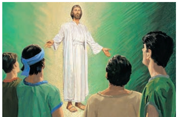
Jesus touched each disciple except the three who would stay on the earth. Then he left. 3 Nephi 28:12