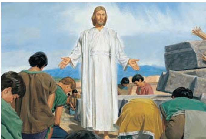
Then the people praised Jesus and fell at his feet and worshiped him. 3 Nephi 11:17