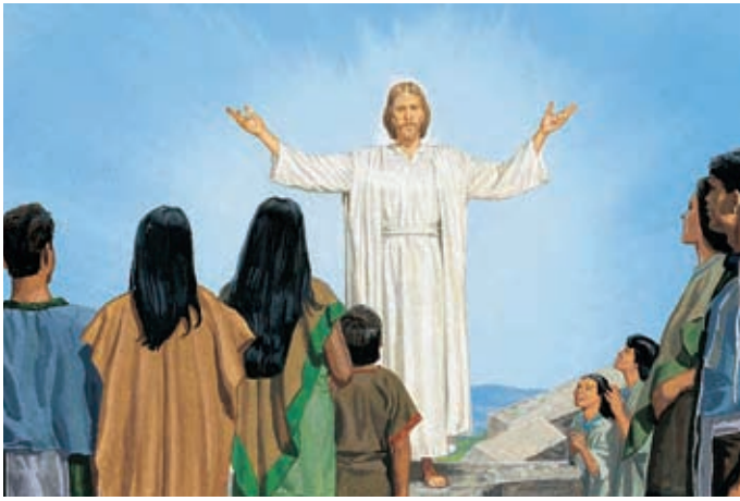
He told them he was Jesus Christ, the one the prophets had said would come. 3 Nephi 11:10