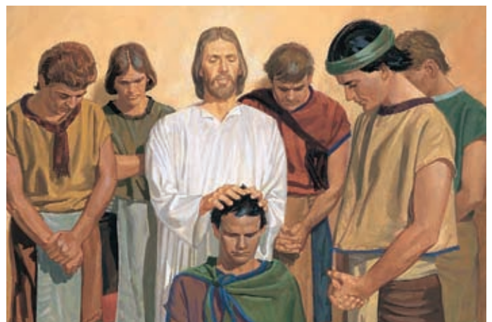
Jesus called Nephi and 11 other men to him. He gave them priesthood power and taught them the right way to baptize. 3 Nephi 11:18, 21-26; 12:1