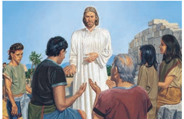
One by one the people felt the marks in Jesus' side, hands, and feet. The people knew he was the Savior. 3 Nephi 11:15