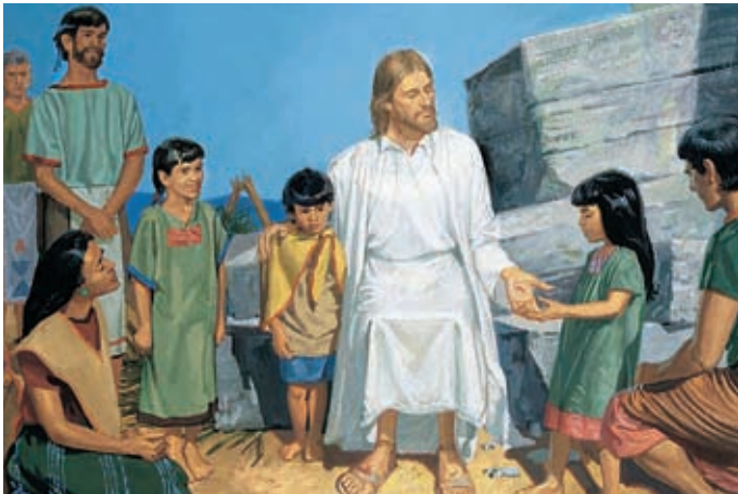
Jesus wanted the people to know that he was their God and that he had died for their sins. 3 Nephi 11:14