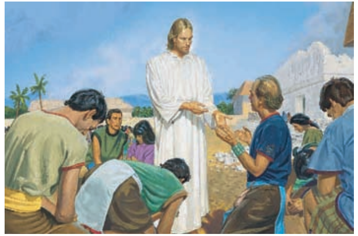
Jesus told the people to come and feel the marks in his side and in his hands and feet, where he had been nailed to the cross. 3 Nephi 11:14