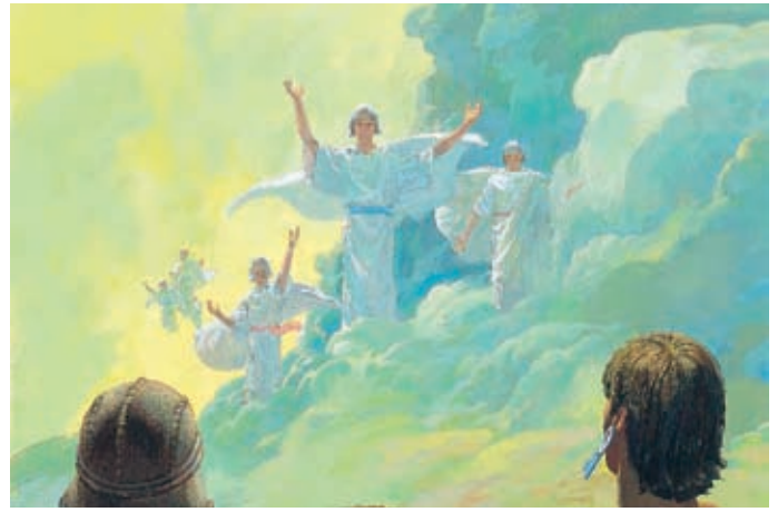
The Lamanites looked up to see where the voice had come from. They saw angels coming down from heaven. Helaman 5:48