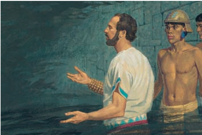
The Lamanites asked Aminadab how to get rid of the dark cloud. He told them to repent and pray until they had faith in Jesus Christ. Helaman 5:40–41