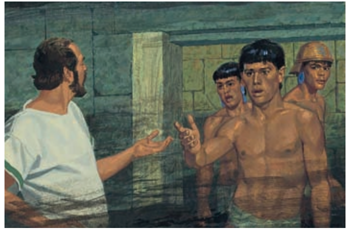
The man, who was named Aminadab, told the Lamanites that Nephi and Lehi were talking to angels. Helaman 5:39