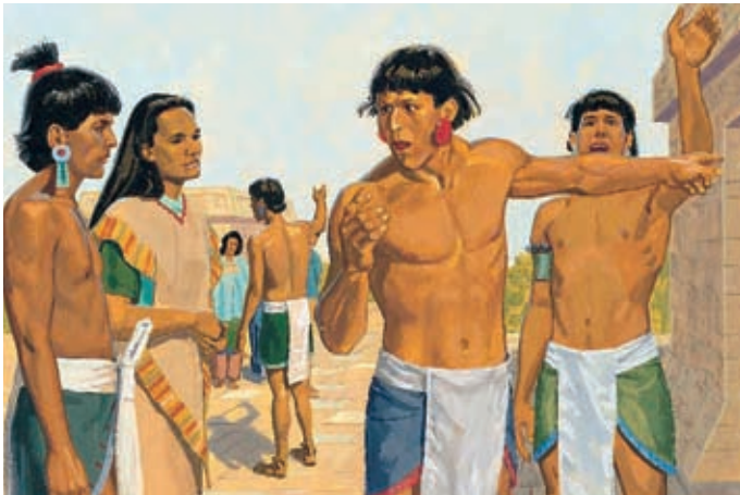
About 300 people saw and heard what happened in the prison. They went and told others. Helaman 5:49-50