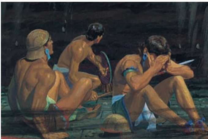
The voice spoke three times, and the ground and prison walls continued to shake. The Lamanites could not run away because it was too dark and they were too scared. Helaman 5:33–34