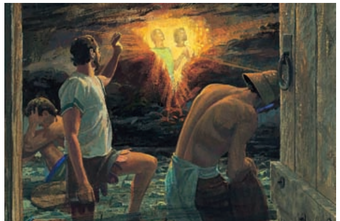
A Nephite who had been a Church member saw that Nephi's and Lehi's faces were shining through the darkness. Helaman 5:35–36