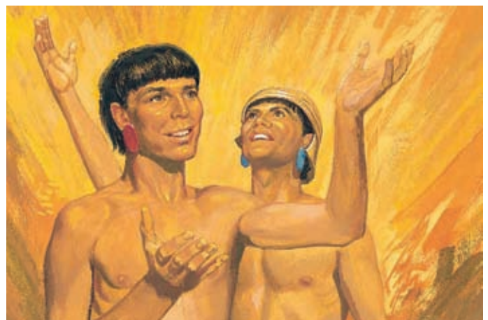
The Lamanites felt great joy, and the Spirit of God filled their hearts. Helaman 5:44–45