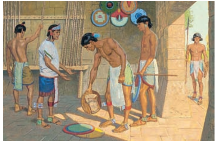
Most of the Lamanites believed them and put away their weapons. Helaman 5:50-51