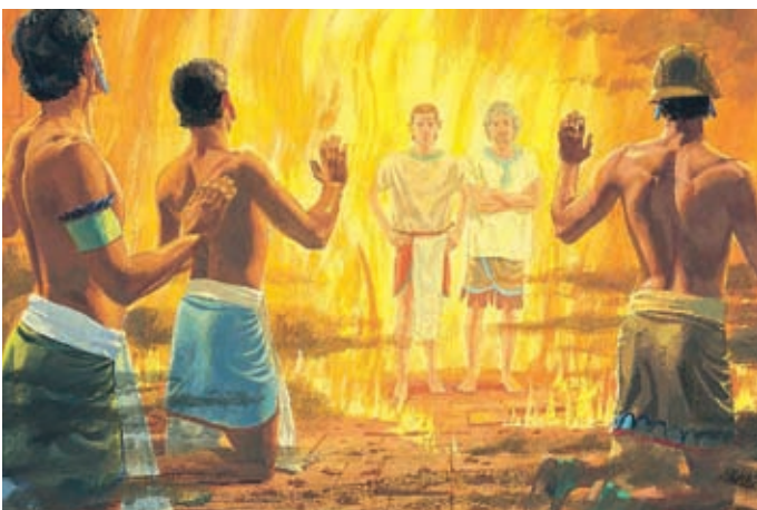
When the darkness left, the people saw a pillar of fire all around them. The fire did not burn them or the prison walls. Helaman 5:43–44