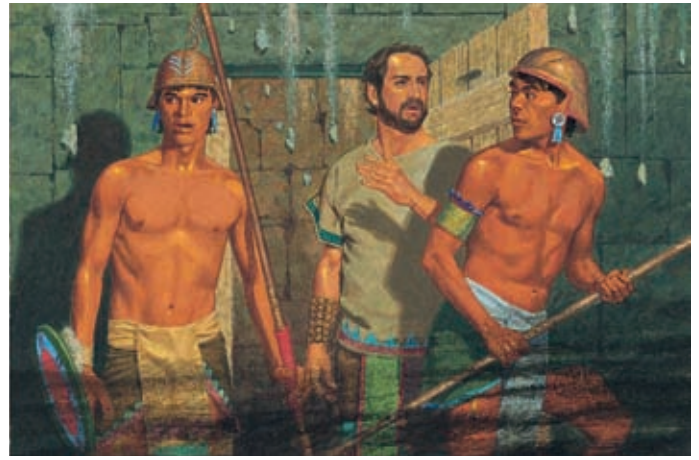
The ground and the prison walls began to shake. A dark cloud surrounded the people in the prison, and they were afraid. Helaman 5:27–28