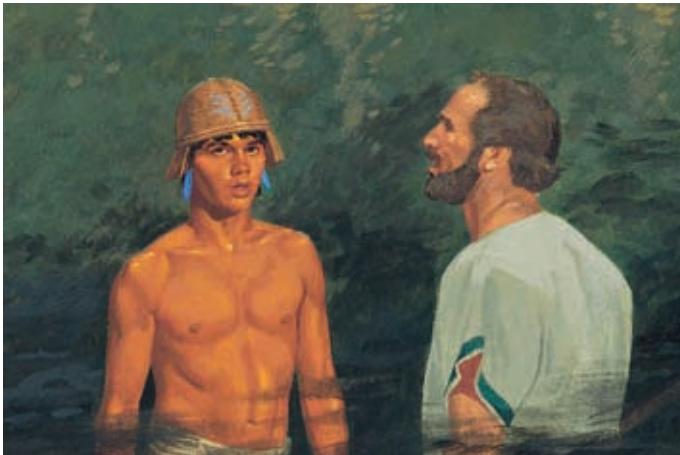
A voice from above the darkness spoke. It was quiet like a whisper, but everyone could hear it. Helaman 5:29–30