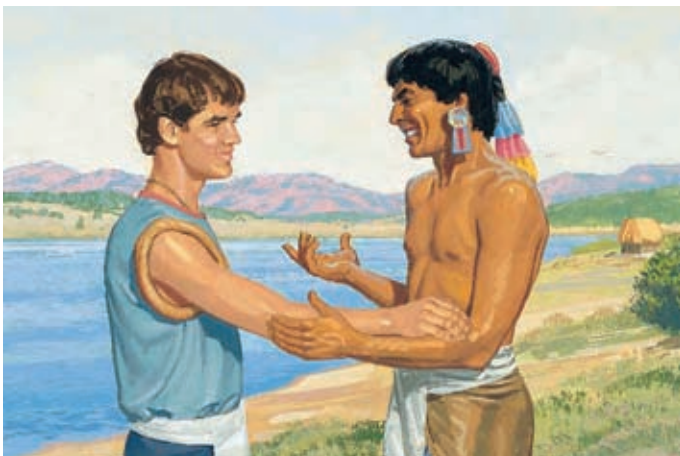
The Lamanites stopped hating the Nephites and gave back the land they had taken. The Lamanites became more righteous than the Nephites. Helaman 5:50, 52