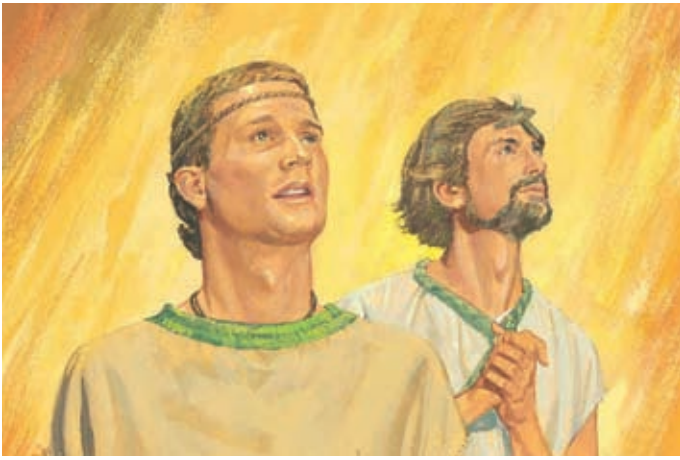
Nephi and Lehi were looking toward heaven and talking. The man told the Lamanites to look. They wondered whom Nephi and Lehi were talking to. Helaman 5:36–38