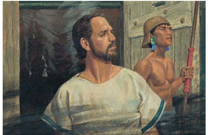
The voice told the people to repent and stop trying to kill Nephi and Lehi. Helaman 5:29–30