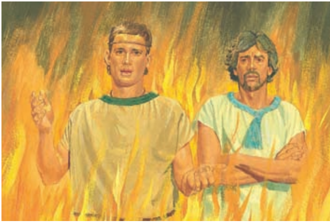
Nephi and Lehi were not burned by the fire. They told the Lamanites that God's power was protecting them. Helaman 5:24–26