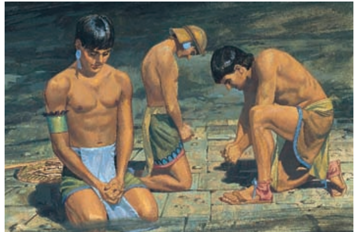
The Lamanites prayed until the dark cloud was gone. Helaman 5:42