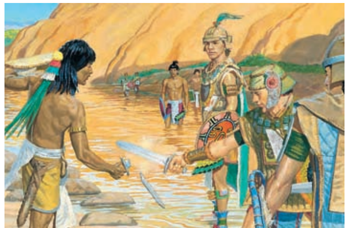
Zerahemnah rushed at Moroni to kill him, but a Nephite soldier hit and broke Zerahemnah's sword. Alma 44:12