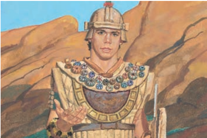
Moroni said the Lamanites could not destroy the Nephites' faith in Jesus Christ. He said God would continue to help the Nephites fight as long as they were faithful. Alma 44:4