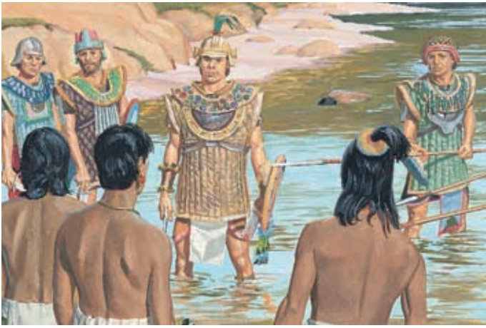
The Lord strengthened the Nephite army. The army surrounded the Lamanites, and Moroni ordered the fighting to stop. Alma 43:50, 52-54