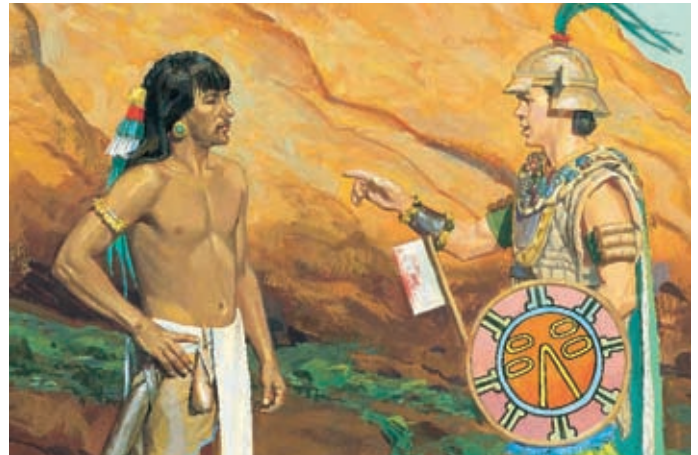
Moroni ordered Zerahemnah to give up his weapons. The Lamanites would not be killed if they promised never to fight the Nephites again. Alma 44:5-6