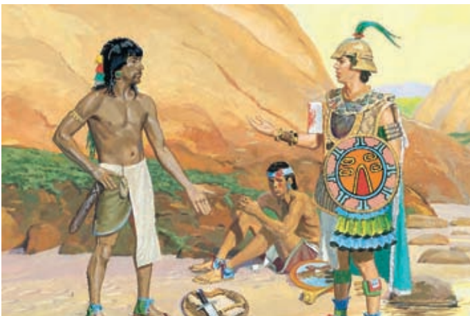
Zerahemnah gave Moroni his weapons but would not promise not to fight. Moroni handed the weapons back so the Lamanites could defend themselves. Alma 44:8, 10