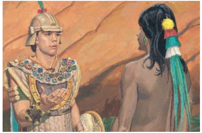
Moroni told Zerahemnah that the Nephites did not want to kill the Lamanites or make them their slaves. Alma 44:1-3