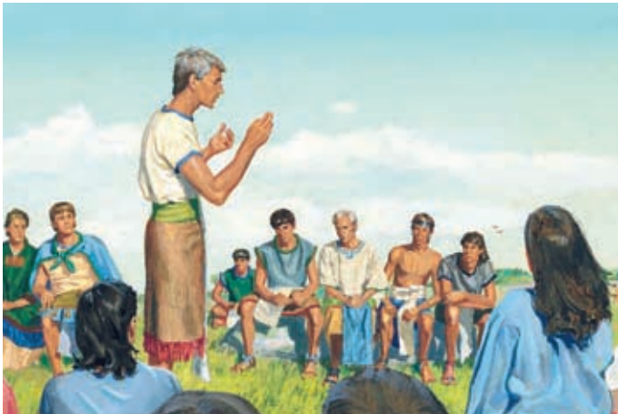
Many asked Alma what they should do. Alma told them they did not need to be inside a church to pray or to worship God. Alma 32:5, 10-11