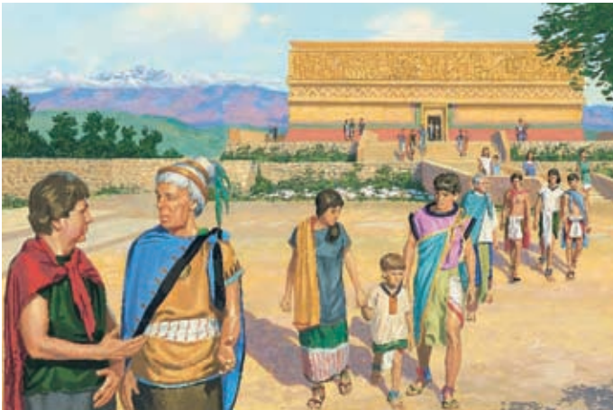
After each of the Zoramites had prayed, they went home and did not pray or talk about God again for an entire week. Alma 31:12, 23