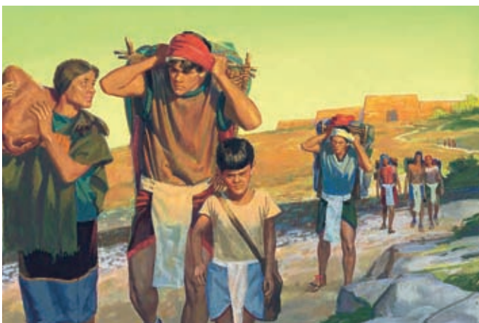
The missionaries left, and the Zoramites who had believed them were thrown out of the city. The believers went to live in the land of Jershon with the people of Ammon. Alma 35:1-2, 6