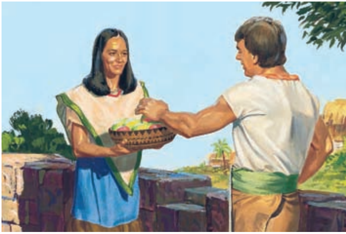
The missionaries then went in separate directions to preach. God blessed them with food and clothing and strengthened them in their work. Alma 31:37-38