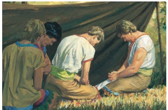
After asking for help to bring the Zoramites back to the truth, Alma and the other missionaries were filled with the Holy Ghost. Alma 31:34–36