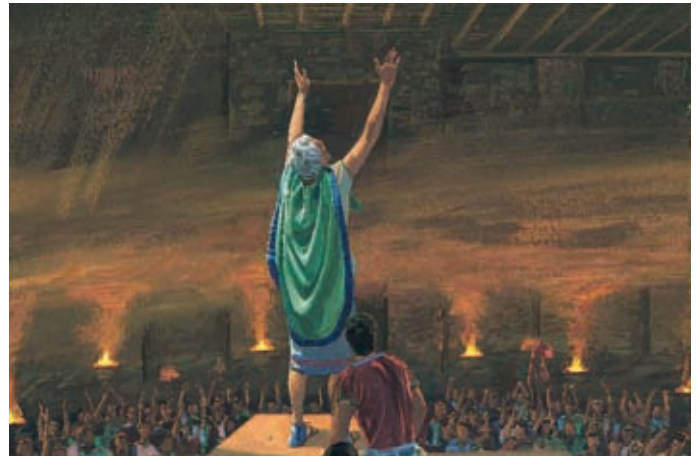
The Zoramites thought God had chosen only them to be saved in the kingdom of heaven. They gave thanks for being his favorite people. Alma 31:17–18