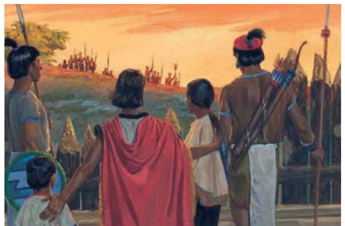
Although the wicked Zoramites threatened the people of Ammon, the people of Ammon helped the righteous Zoramites and gave them food, clothing, and land. Alma 35:8-9