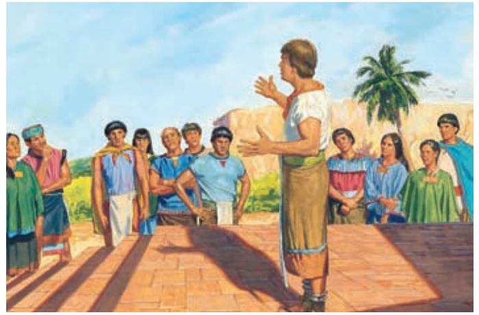
Zoramites who were poor were not allowed inside the churches. These people began listening to the missionaries. Alma 32:2-3