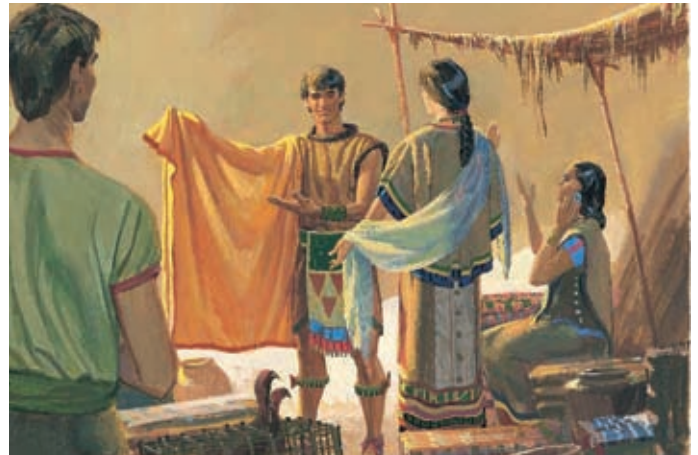
The wealthy Zoramites loved gold and silver, and they bragged about their worldly treasures. Alma was sad to see how wicked they were. Alma 31:24–25