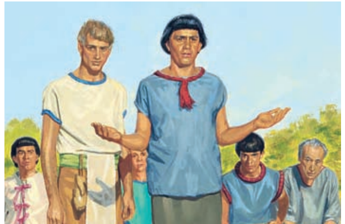
He told them to have faith in God. Then Amulek taught them about Jesus Christ and about God's plan for his children. Alma 32:17-21; 34:8-9