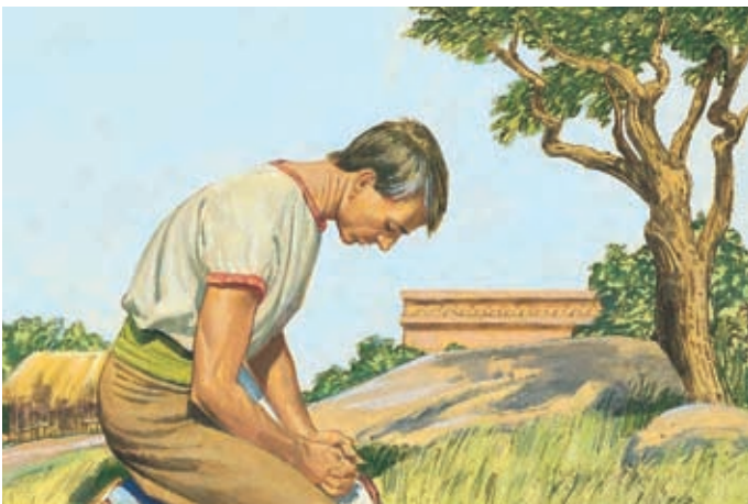
Alma prayed for him and his missionaries to have strength, comfort, and success in their work. Alma 31:26, 32–33