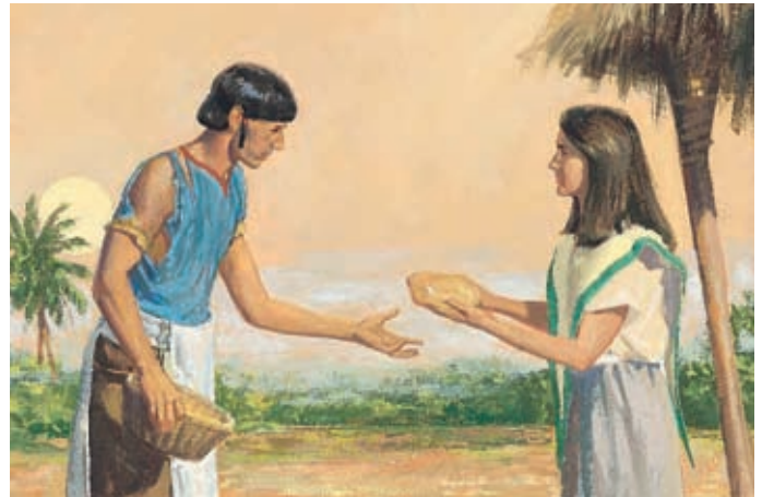
The Lord did not give Korihor back his speech. Korihor went from house to house, begging for food. Alma 30:56