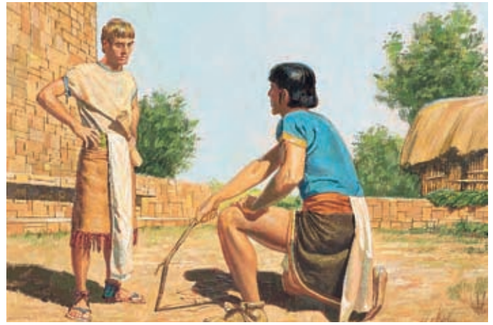
Korihor wrote that he knew this sign was from God and that he had always known there is a God. He asked Alma to pray and remove the curse. Alma 30:52, 54