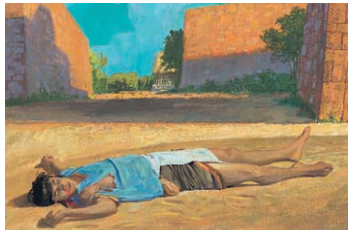
Korihor went to live with the Zoramites. One day while he was begging, he was trampled to death. Alma 30:59