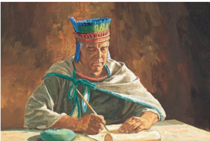
The chief judge sent a letter throughout the land telling what had happened to Korihor. He told those who had believed Korihor to repent. The people repented. Alma 30:57-58