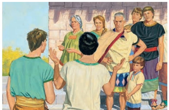
Amulek said Alma was a prophet of God and spoke the truth. The people were surprised to hear Amulek's testimony. Alma 10:9-10, 12