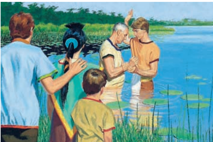
Zeezrom was baptized and began to preach the gospel. Many others were also baptized. Alma 15:12, 14