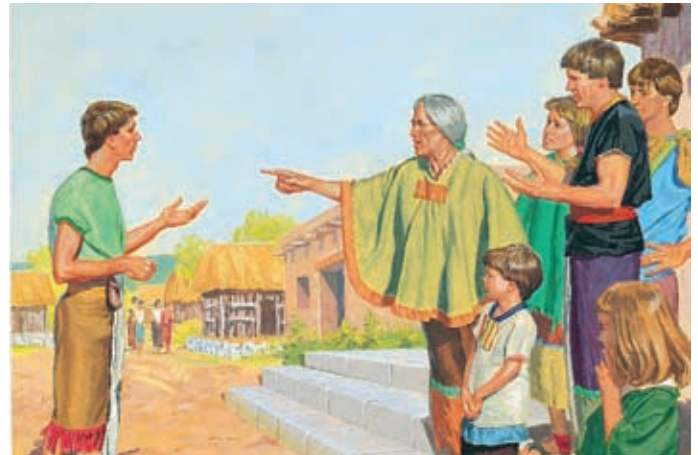
The people of Ammonihah became angry. They tried to throw Alma into prison, but the Lord protected him. Alma 9:31-33