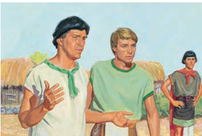
Then Amulek began to teach. Many of the people knew Amulek; he was not a stranger as Alma was. He told them about the angel he had seen. Alma 9:34; 10:4, 7