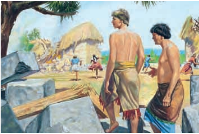
The people of Ammonihah came to see what was happening. When they saw Alma and Amulek walking out of the crumbled prison, they became scared and ran away. Alma 14:28–29