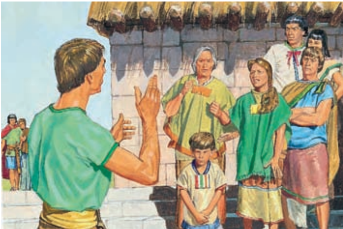
Alma told the people to repent or God would destroy them. He said Jesus Christ would come and save those who had faith in him and repented. Alma 9:12, 26-27