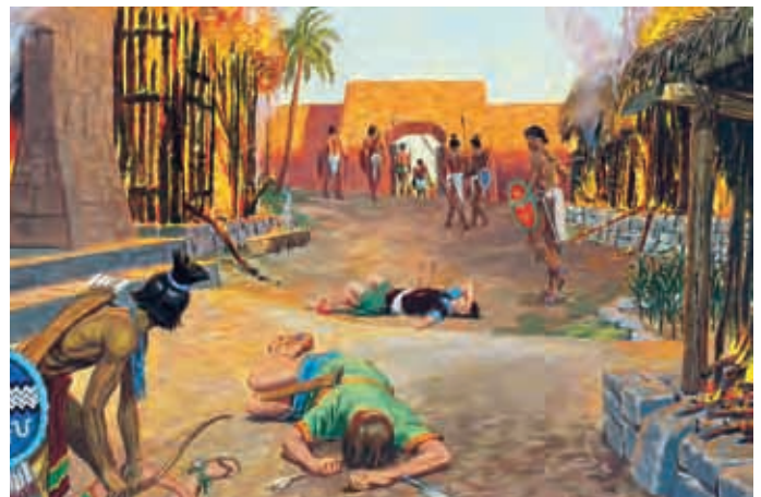
The wicked people of Ammonihah were all killed by a Lamanite army, as Alma had prophesied. Alma 10:23; 16:2, 9