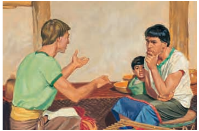
Alma told Amulek about his calling to teach the people of Ammonihah. Amulek went with Alma to teach the people. The Holy Ghost helped them. Alma 8:24-25, 30