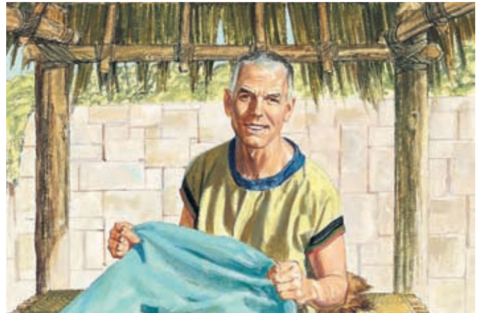
Zeezrom believed in Jesus Christ and had repented of his sins. When Alma prayed for him, Zeezrom was immediately healed. Alma 15:10–11