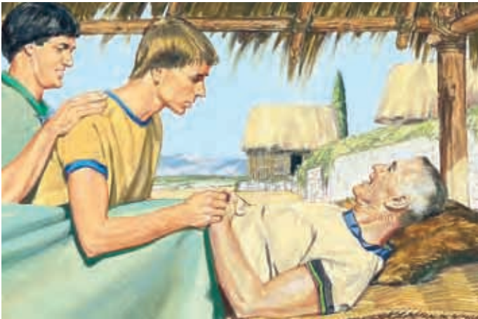
Zeezrom was glad to see Alma and Amulek. He worried that they had been killed because of what he had done. He asked them to heal him. Alma 15:4–5