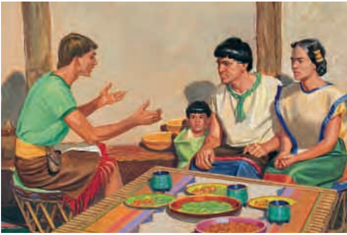
This man, Amulek, took Alma to his home and fed him. Alma stayed with Amulek and his family for many days. He thanked God for Amulek's family and blessed them. Alma 8:21-22, 27