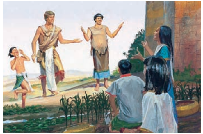
The Lord told Alma and Amulek to go to Sidom. There they found the righteous people. Zeezrom was also there and was very sick. Alma 15:1–3