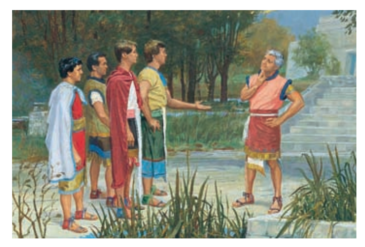
Mosiah's sons each refused to be king. Instead, they wanted to be missionaries to the Lamanites and share the blessings of the gospel with them. Mosiah 28:1, 10; 29:3