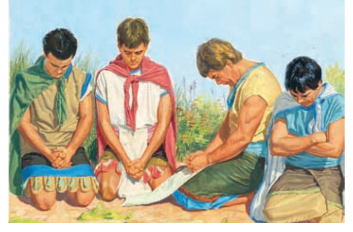
Mosiah's sons went to teach the Lamanites. They fasted and prayed that they would be good missionaries. Mosiah 28:9; Alma 17:9