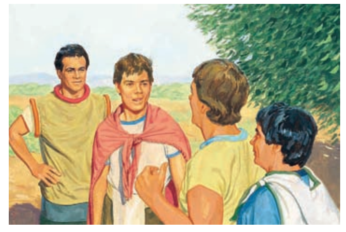
The sons of Mosiah had repented of their sins and were sorry for the trouble they had caused. They knew the gospel was true, and they wanted to teach it to others. Mosiah 27:35–36