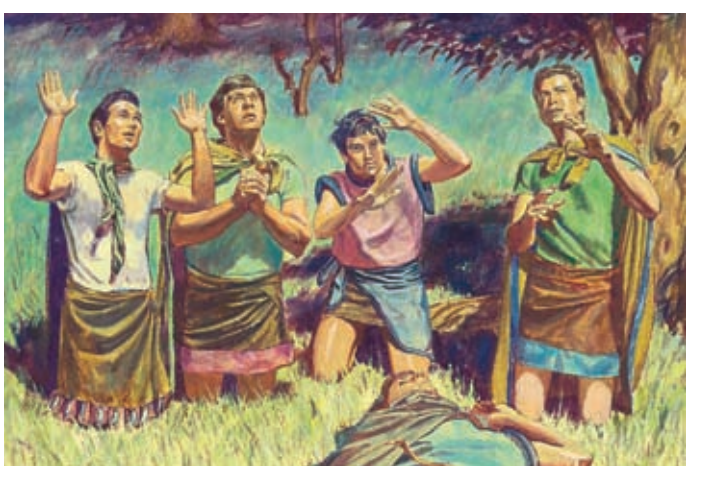
Mosiah had four sons: Ammon, Aaron, Omner, and Himni. They were with Alma the Younger when an angel appeared to him. Mosiah 27:11, 34