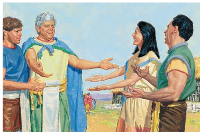
Ammon guided King Limhi and his people through the wilderness to Zarahemla, where they were welcomed. Mosiah 22:13-14