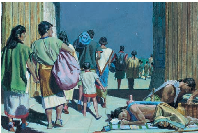
King Limhi and his people were able to walk past the drunken guards and escape. Mosiah 22:11