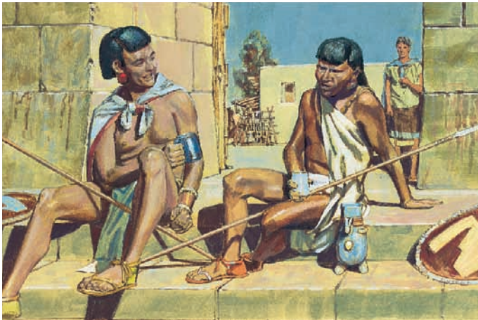
The Nephites learned that the Lamanites who guarded the city usually got drunk at night. Mosiah 22:6