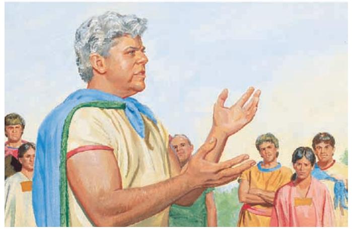
He told his people to repent, trust God, and obey the commandments. Then God would help them escape. Mosiah 7:19, 33