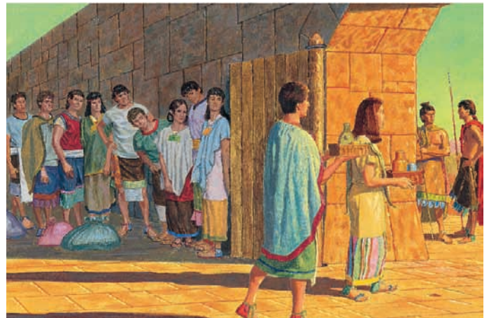
That night King Limhi sent extra wine to the guards as a present. Mosiah 22:10