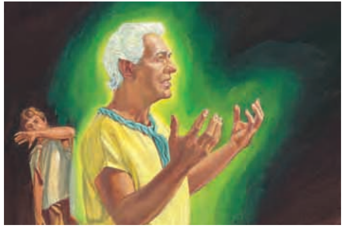
The Holy Ghost protected Abinadi so he could finish saying what the Lord wanted him to. Abinadi's face was shining. The priests were afraid to touch him. Mosiah 13:3, 5