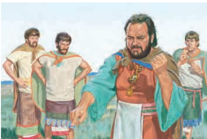
King Noah did not want the men to return to their families. He ordered them to stay with him. Mosiah 19:20