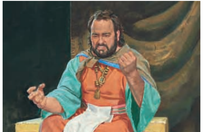
King Noah told Abinadi that if he did not deny all he had said, he would be killed. Mosiah 17:8