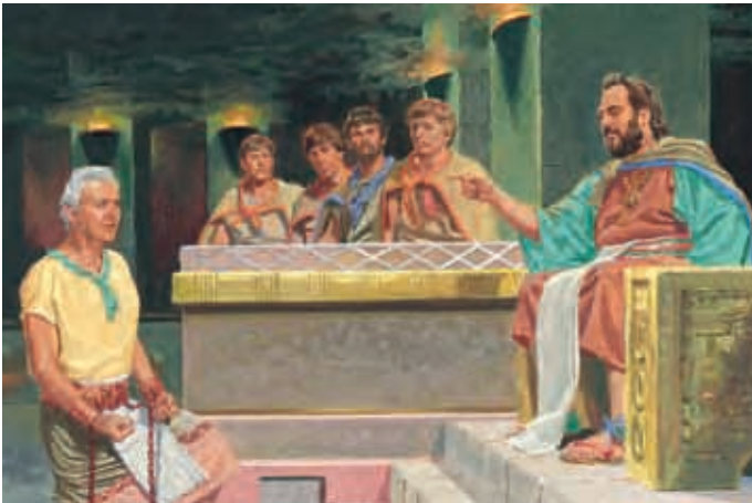
After spending three days in prison, Abinadi was again brought before King Noah. The king told Abinadi to take back what he had said against him and his people. Mosiah 17:6, 8