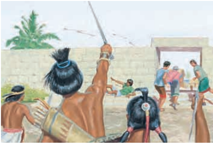
Some of the Nephites opposed King Noah and tried to kill him. The Lamanite army also came to fight the king and his followers. Mosiah 19:2-7