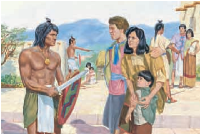
Many of the men would not leave. They were captured by the Lamanites. Mosiah 19:12, 15