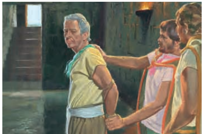
King Noah and all but one of his priests refused to believe Abinadi. Noah told the priests to kill Abinadi. They tied him up and threw him in prison. Mosiah 17:1, 5