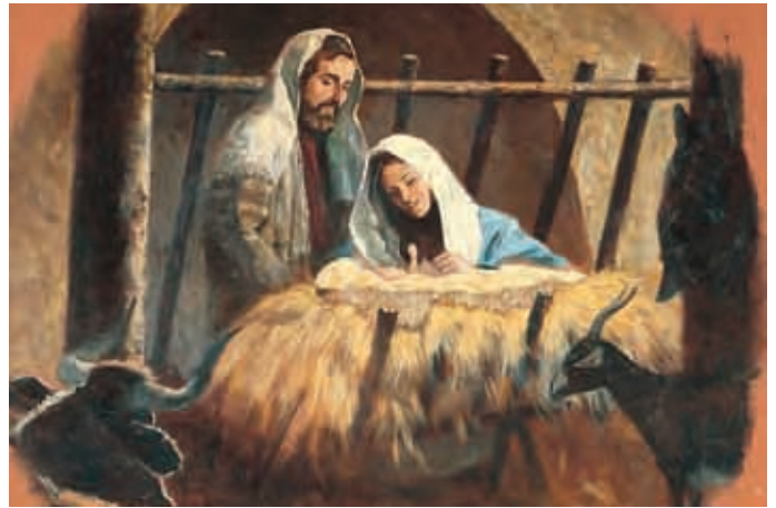
He told them Jesus Christ would be born on the earth. Jesus would make it possible for people to repent, be resurrected, and live with God. Mosiah 13:33-35; 15:21-23