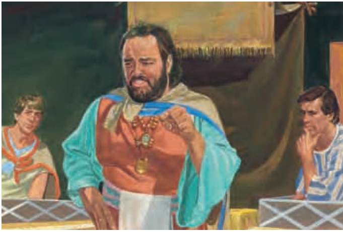
King Noah was angry and ordered his priests to kill Abinadi. Abinadi said if they touched him, God would kill them. Mosiah 13:1-3