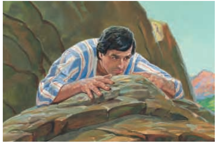
The king was angry with Alma and had him thrown out. Then he sent his servants to kill him. Alma ran and hid, and the servants never found him. Mosiah 17:3-4