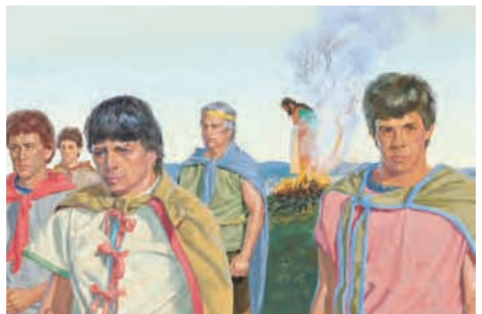
The men were angry with King Noah. They burned him to death, as Abinadi had prophesied. Then they went back to their families. Mosiah 19:20, 24