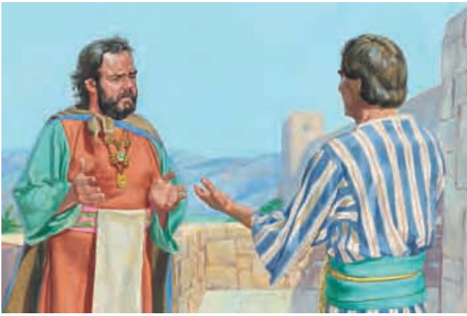
The one priest who believed Abinadi was named Alma. He asked King Noah to let Abinadi go. Mosiah 17:2