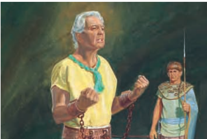
Abinadi knew he had spoken the truth. He was willing to die rather than take back what God had sent him to say. Mosiah 17:9-10