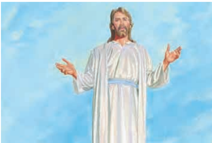
Abinadi told the people to repent and believe in Jesus Christ or they would not be saved. Mosiah 16:13