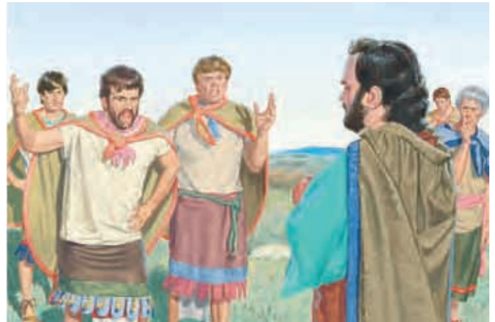
Most of the men who had run away with King Noah were sorry. They wanted to go back and help their wives and children and their people. Mosiah 19:19