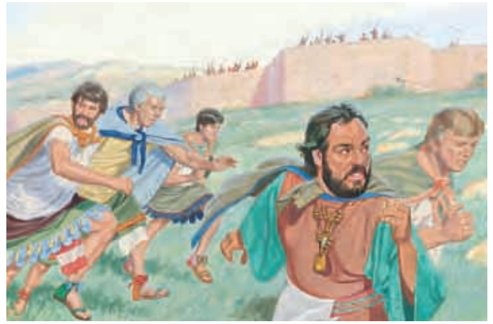
The king and his followers ran from the Lamanites, but the Lamanites caught up and began killing them. The king told his men to leave their families and keep running. Mosiah 19:9-11