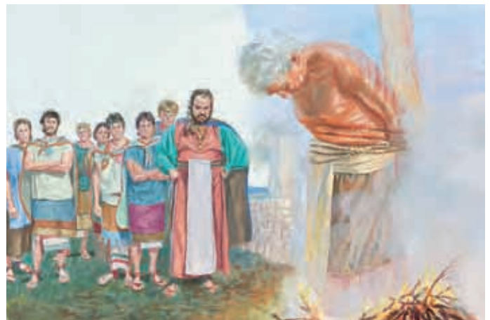
King Noah ordered his priests to kill Abinadi. They tied him up, whipped him, and burned him to death. Before he died, Abinadi said King Noah would also die by fire. Mosiah 17:13-15