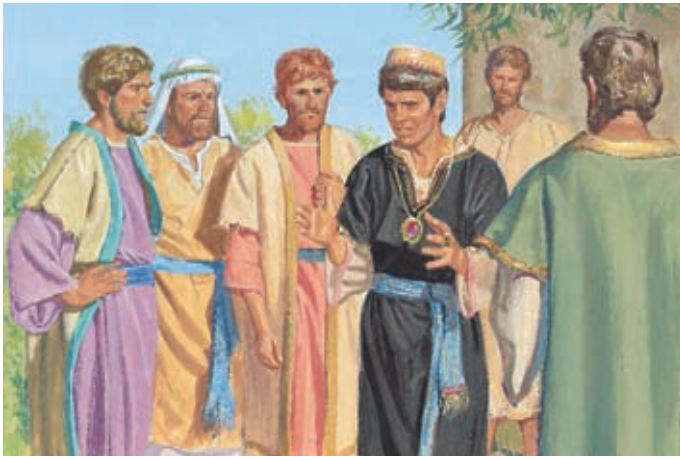
Sherem told the people that there would be no Christ. Many people believed Sherem. Jacob 7:2-3