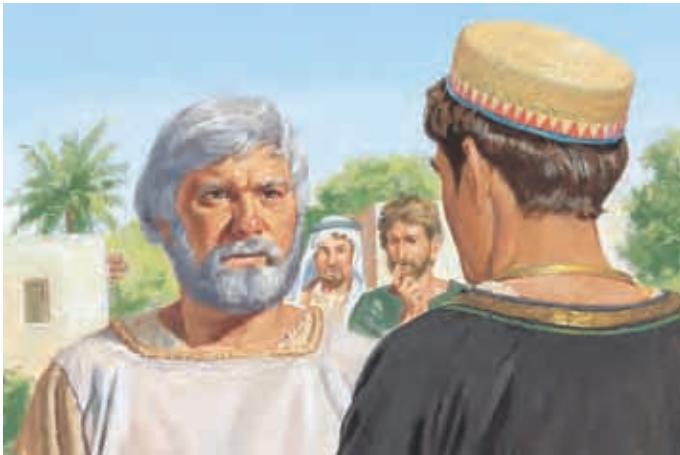
Jacob's faith in Jesus Christ could not be shaken. He had seen angels and had heard the Lord's voice. He knew Jesus would come. Jacob 7:5