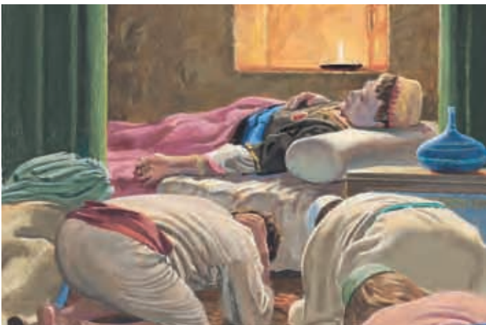
After Sherem finished talking to the people, he died. The people felt God's power, and they fell to the ground. Jacob 7:20-21