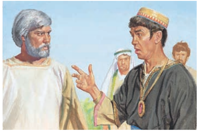
Jacob taught the people to believe in Christ. Sherem wanted to argue with Jacob and persuade him that there would be no Christ. Jacob 7:6