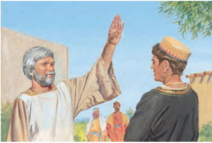
Jacob said if God struck Sherem, that would be a sign of God's power. Jacob 7:14