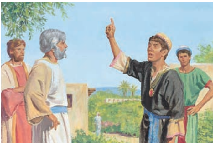
Sherem asked to see a sign. He wanted Jacob to prove there is a God. He wanted to see a miracle. Jacob 7:13