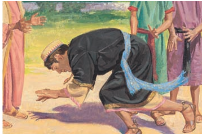
Sherem immediately fell down. He could not get up for many days. Jacob 7:15