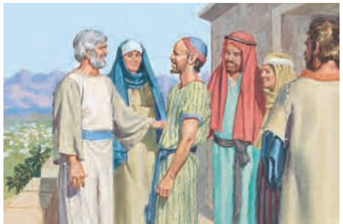
The people began to repent and read the scriptures. They lived in peace and love. Jacob was happy and knew that God had answered his prayers. Jacob 7:22-23