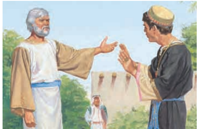
The Holy Ghost was with Jacob as he bore his testimony of Jesus Christ to Sherem. Jacob 7:8-12