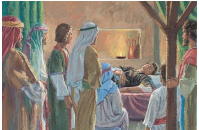
He told them he had lied. He said they should believe in Jesus Christ. Jacob 7:17-19