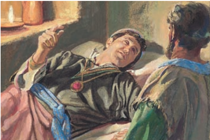
Sherem was weak and knew he was going to die. He called the people together. Jacob 7:16