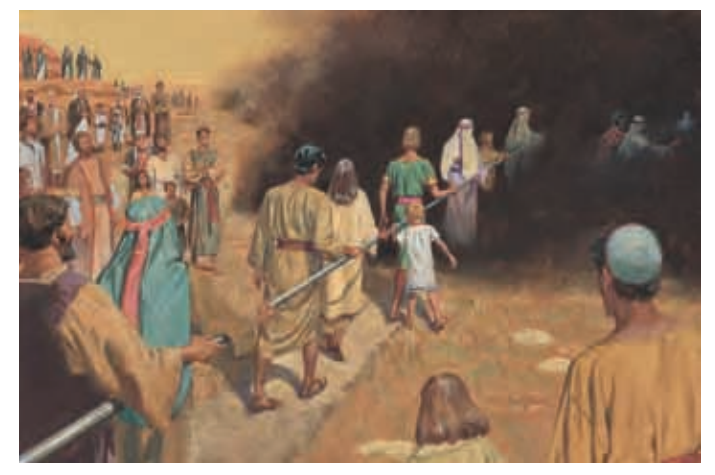
He saw many people walking on or toward the path. Because of a mist of darkness, some wandered off the path and became lost. 1 Nephi 8:21–23