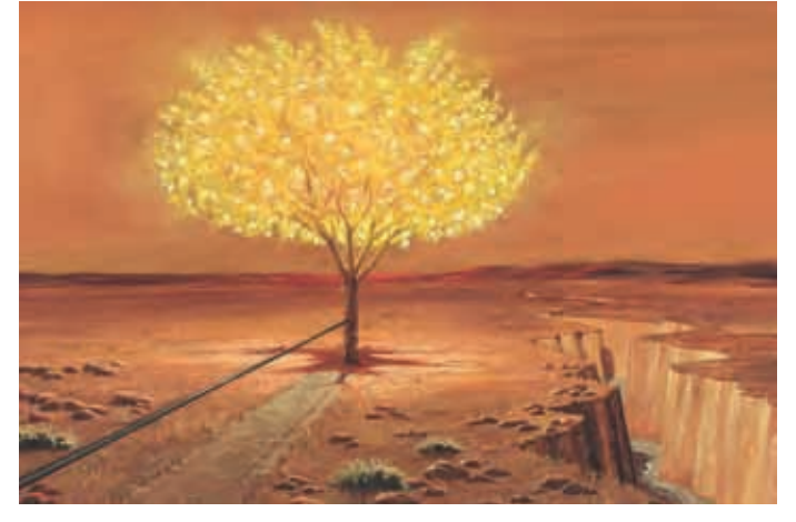
Lehi also saw a rod of iron and a strait and narrow path leading to the tree. 1 Nephi 8:19–20