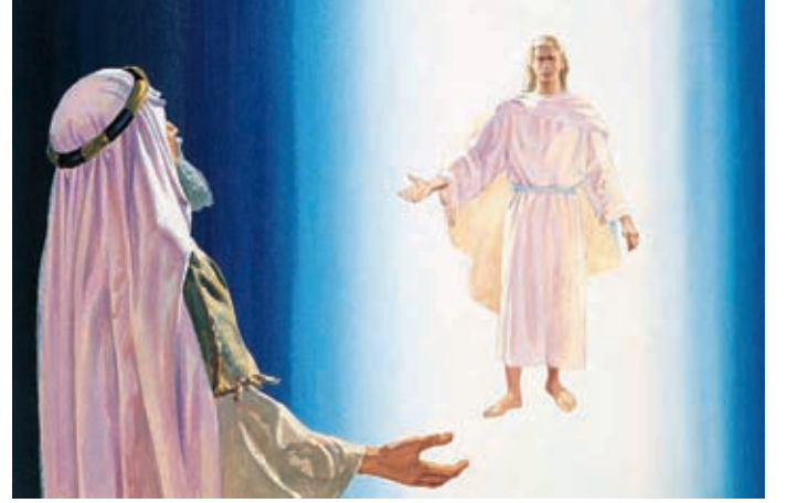
In his dream Lehi saw a man wearing a white robe who told Lehi to follow him. Lehi followed the man into a dark and dreary wilderness. 1 Nephi 8:5–7