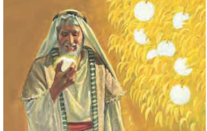
Lehi ate the fruit, and it filled him with joy. He wanted his family to taste the fruit because he knew it would make them happy too. 1 Nephi 8:11–12