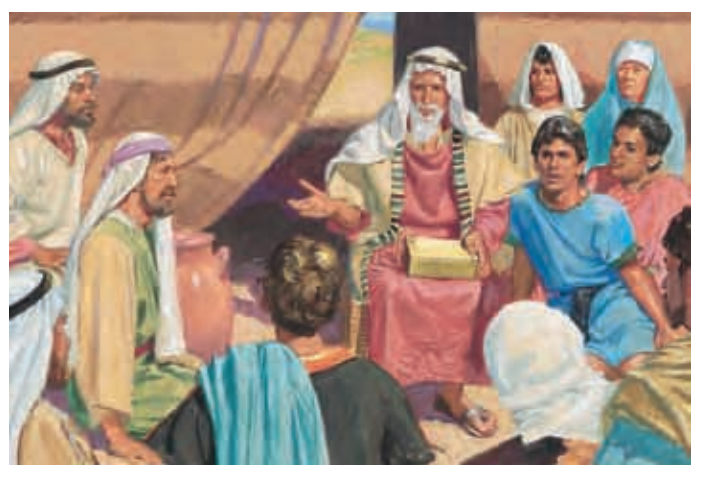
Lehi told his family about an important vision he had had in a dream. Lehi's dream made him happy for Nephi and Sam but sad for Laman and Lemuel.