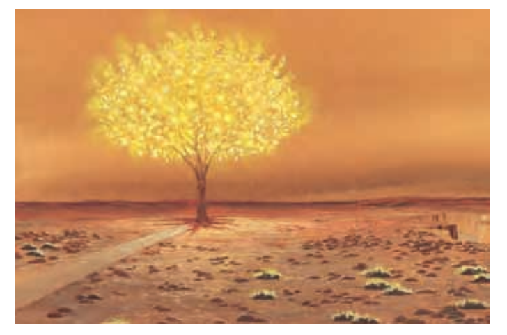
Then he saw a tree with white fruit. This sweet fruit made those who ate it happy. 1 Nephi 8:9–10