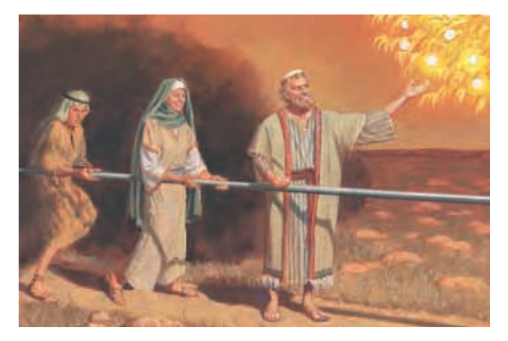
Others held tightly to the iron rod and made it through the darkness to the tree. They tasted the fruit. 1 Nephi 8:24