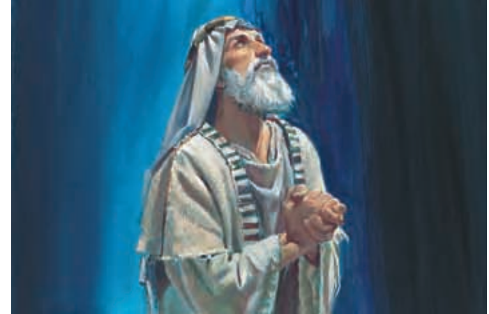
After traveling in the darkness for many hours, Lehi prayed for help. 1 Nephi 8:8