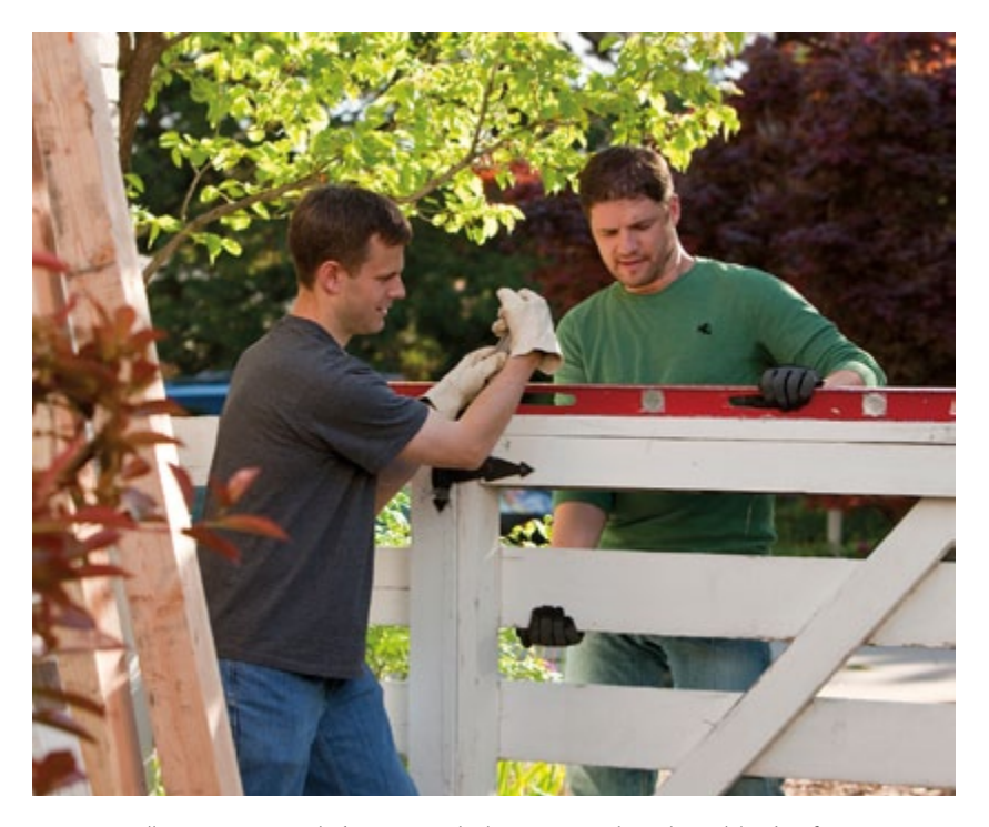
"Let your minds be expanded to comprehend and look after the interest of your friends that are around you."

friends. If he wants to build himself up, the best principle he can do it upon is to build up his friends. . . .