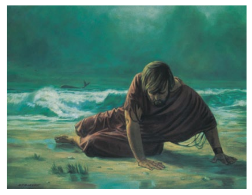
Although Jonah "exhibited weaknesses," we can learn from his "grand and admirable" characteristics.

1:4–12.] Also in other prophets and men of God, although they may have on certain occasions, like Jonah, exhibited weaknesses, there is something really grand and admirable shown in their character.<sup>4</sup> [See suggestion 3 on page 125.]