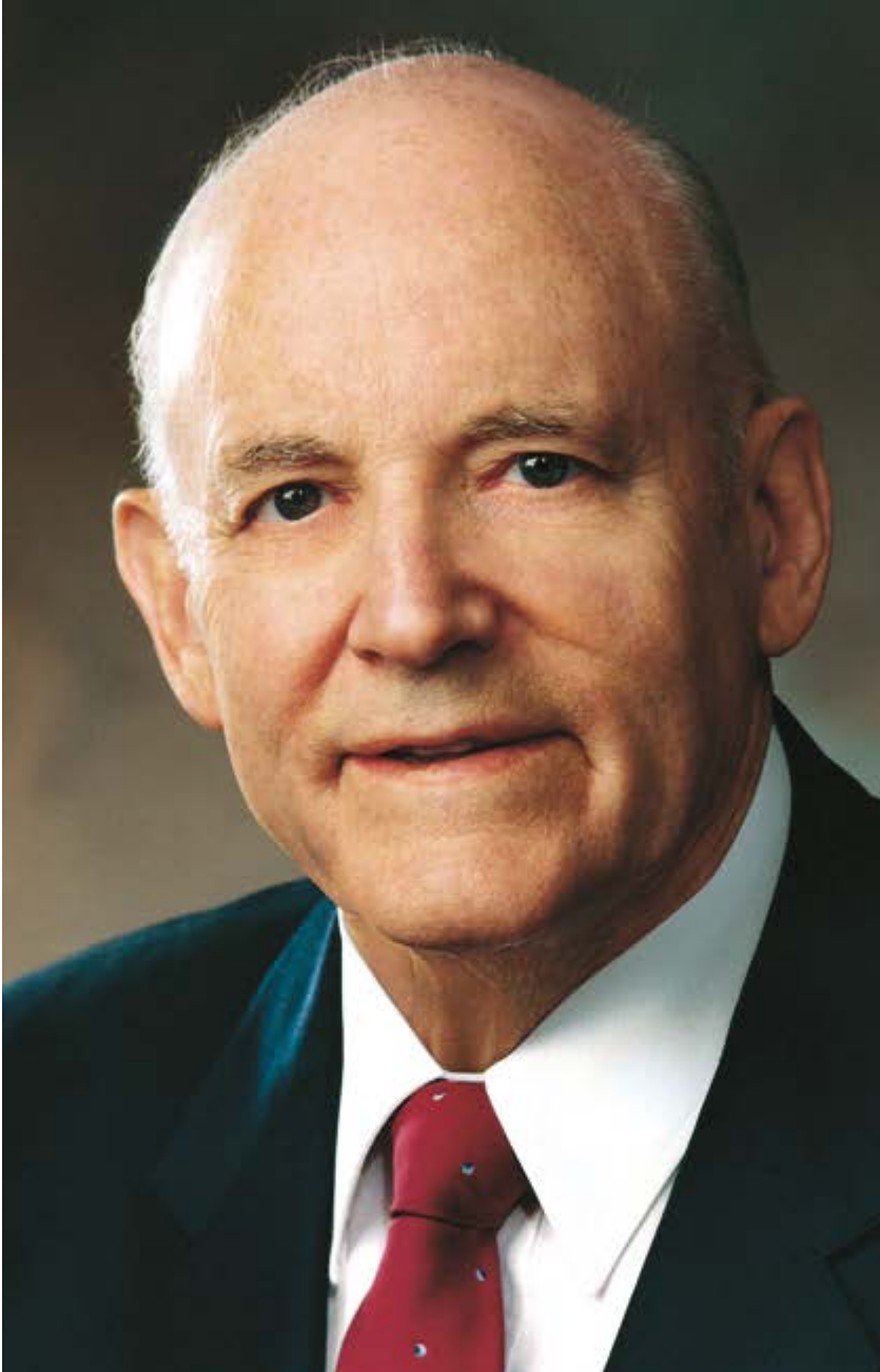
As a member of the Quorum of the Twelve Apostles, President Howard W. Hunter counseled Latter-day Saints to follow the President of the Church.