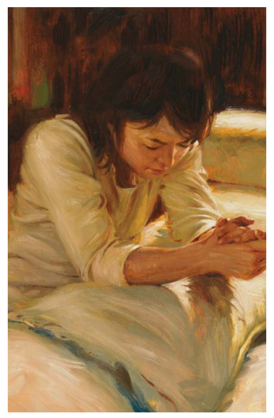
"The Lord promised that if we would be humble in . . . times of need and turn to him for aid, we would 'be made strong, and [be] blessed from on high'" (D&C 1:28).