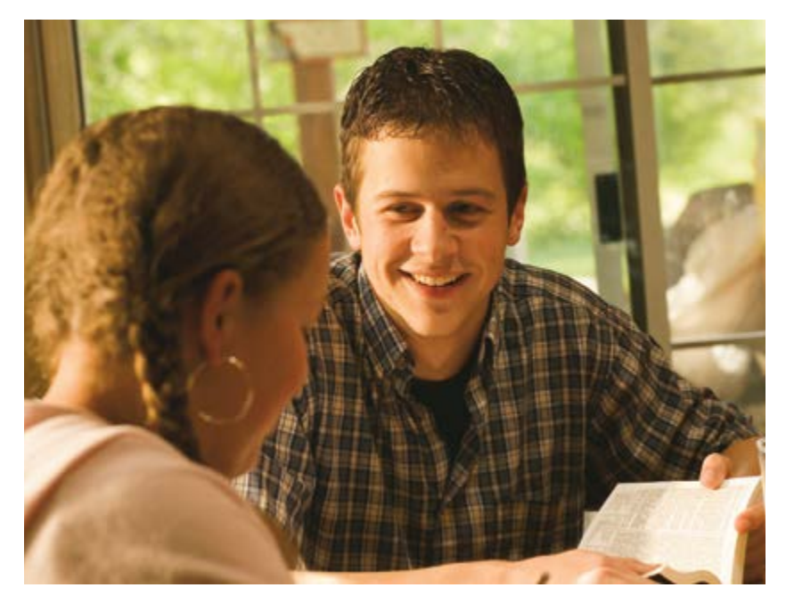
"Disciples of Christ in every generation are invited, indeed commanded, to be filled with a perfect brightness of hope."