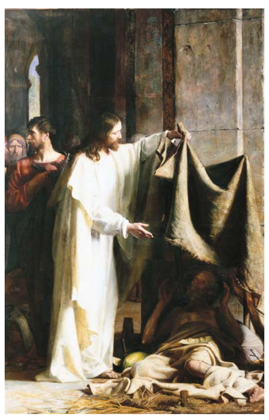
In our trials, the Savior extends to each of us the invitation He extended to the man at the pool of Bethesda: "Wilt thou be made whole?" (John 5:6).