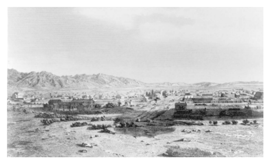
Through their faith and industry, the Saints began to establish a city in the Salt Lake Valley. This engraving shows the valley in 1853.

The Saints worked with energy and faith despite their difficult circumstances, and soon they had made great progress. A traveler on his way to California passed through Salt Lake City in September 1849 and paid tribute to them in this way: "A more orderly, earnest, industrious and civil people, I have never been among than these, and it is incredible how much they have done here in the wilderness in so short a time. In this city which contains about from four to five thousand inhabitants, I have not met in a citizen a single idler, or any person who looks like a loafer. Their prospects for crops are fair, and there is a spirit and energy in all that you see that cannot be equaled in any city of any size that I have ever been in."<sup>4</sup>