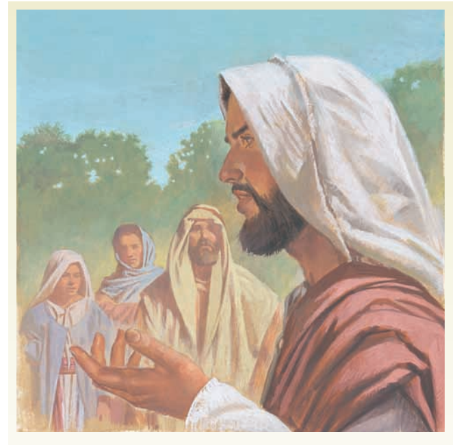
One day the Savior talked to some people who thought that they were more righteous than other people. Jesus told them a story.