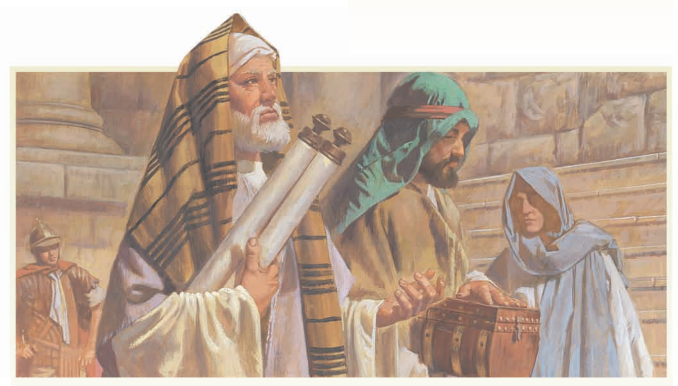
Two men went to the temple to pray. One was a Pharisee. The other was a publican, which is a