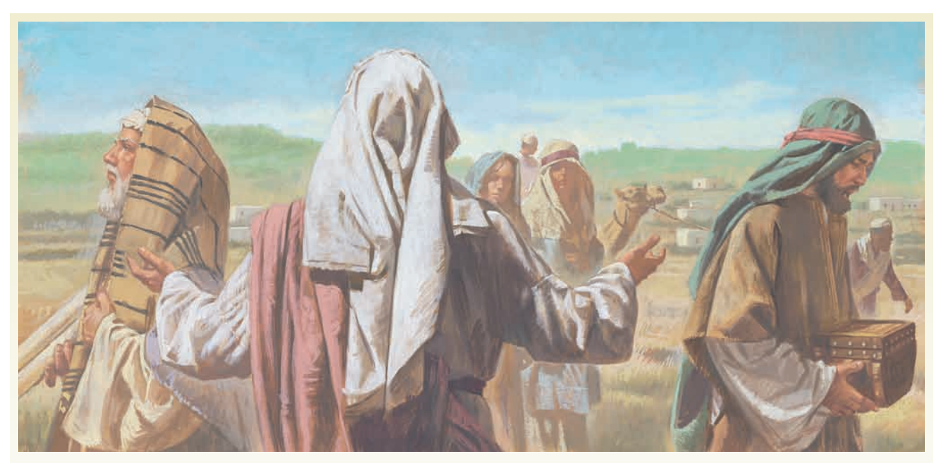
The Pharisee thought he was perfect and did not need God's help. But the publican knew that he