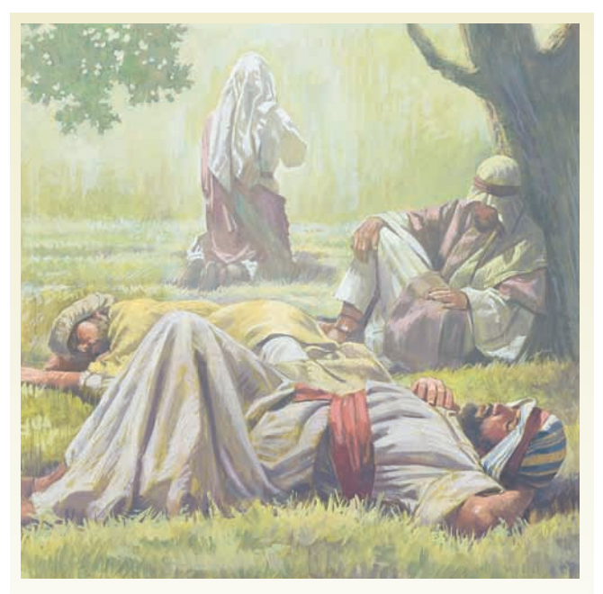
While Jesus was praying, the Apostles fell asleep. Luke 9:32