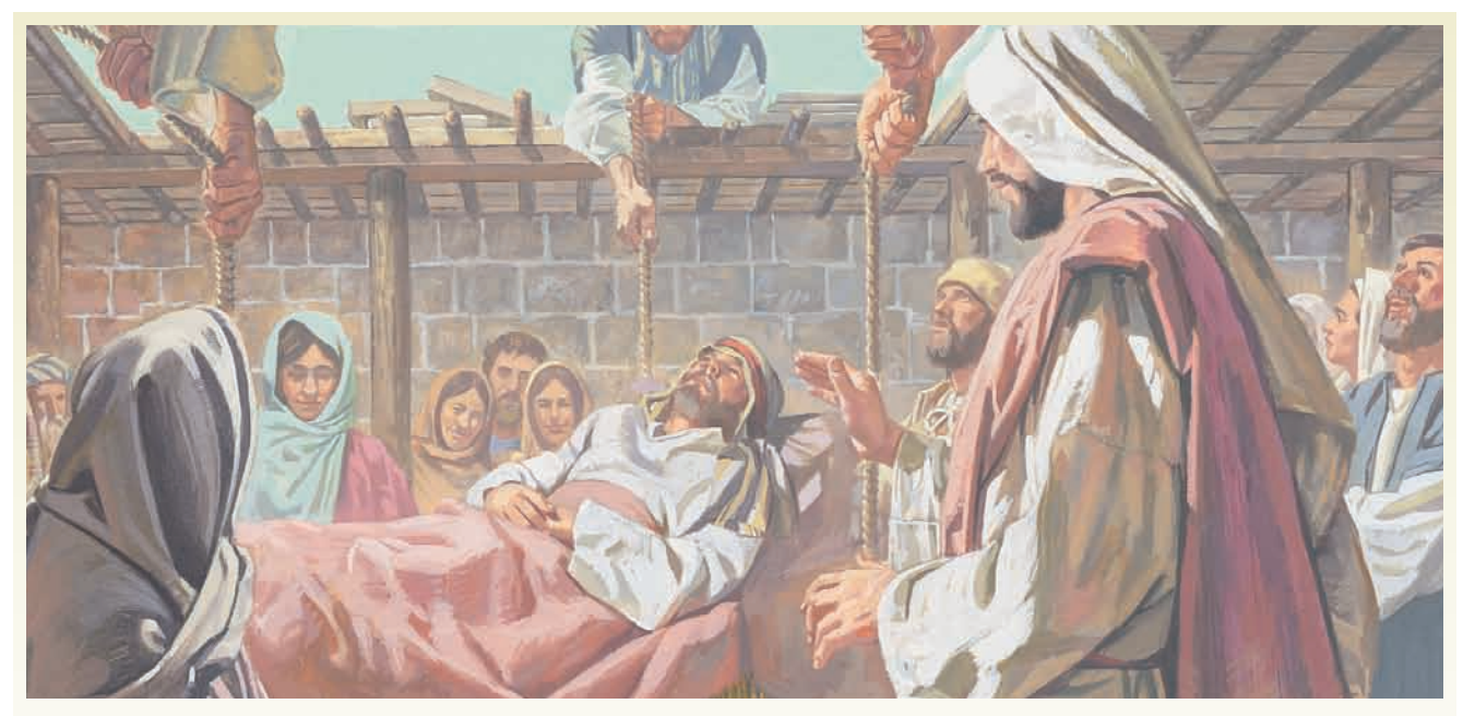
The men took their friend up onto the roof. They removed part of the roof and lowered their friend into the house.