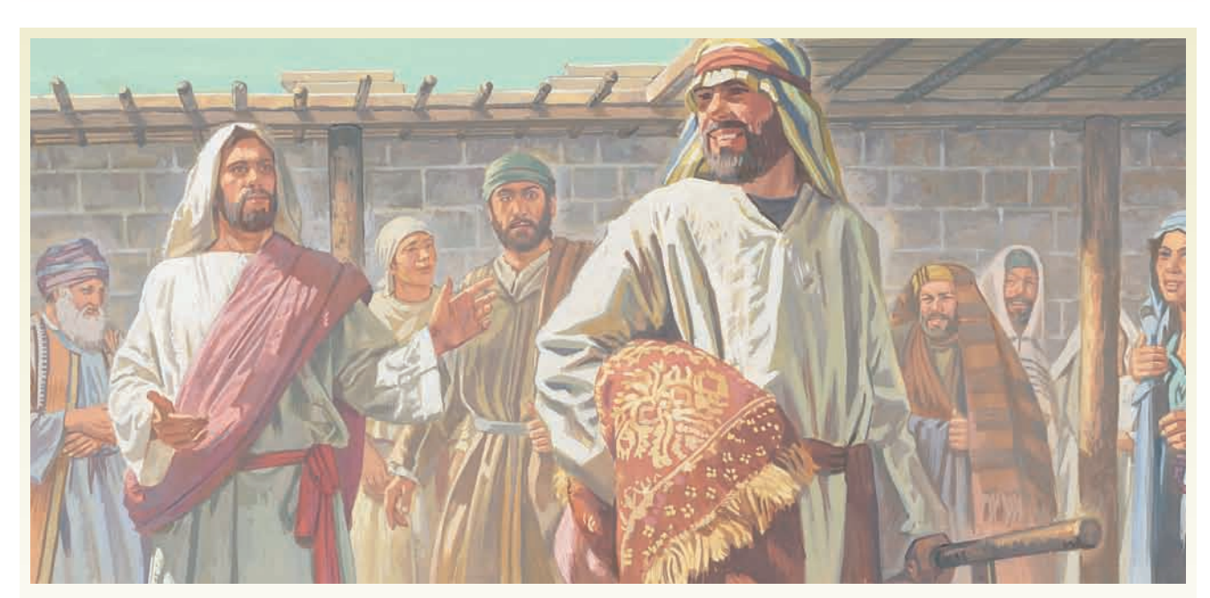
When He saw the great faith of these men, Jesus told the sick man that his sins were forgiven. He told him to pick up his bed and go home. The