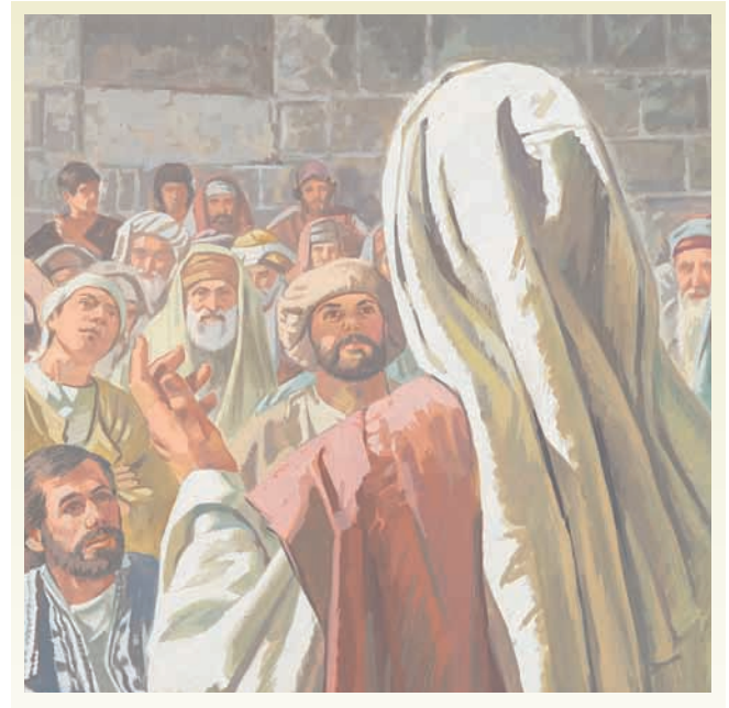
One day Jesus was teaching a group of people in a house.