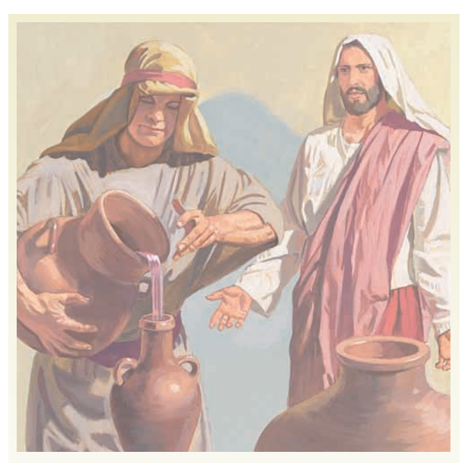
He told the servants to take wine from the jars and serve it to the ruler of the feast.