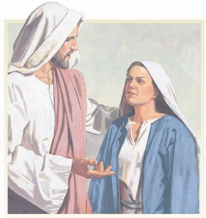
Jesus respected and loved His mother. He asked her what she wanted Him to do.