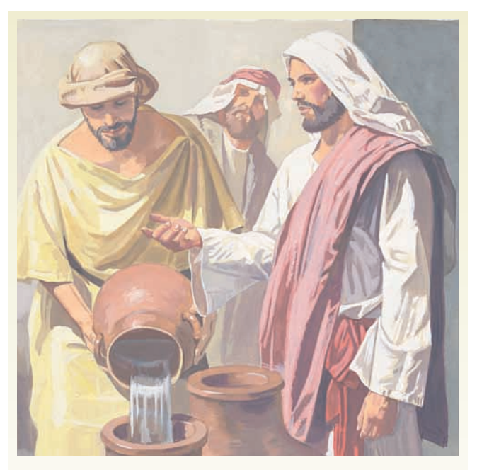
Jesus told the servants to fill six large stone jars with water. Each jar held between 18 and 27 gallons (68 and 102 liters). He then turned the water into wine.