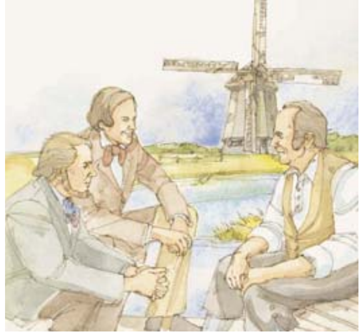
Brigham Young sent missionaries to other lands across the ocean. Thousands of people from many lands joined the Church.