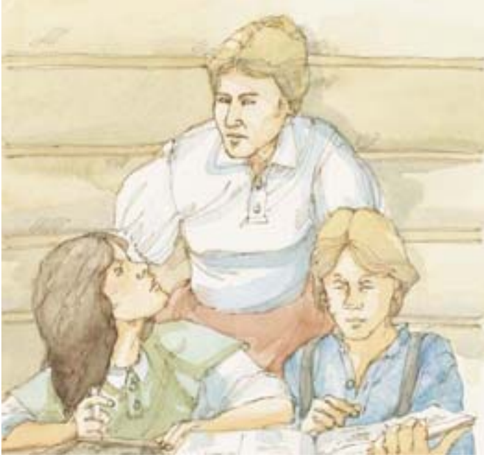
The pioneers started a school. School classes and Church meetings were in the same building. Later the Sunday School was started.