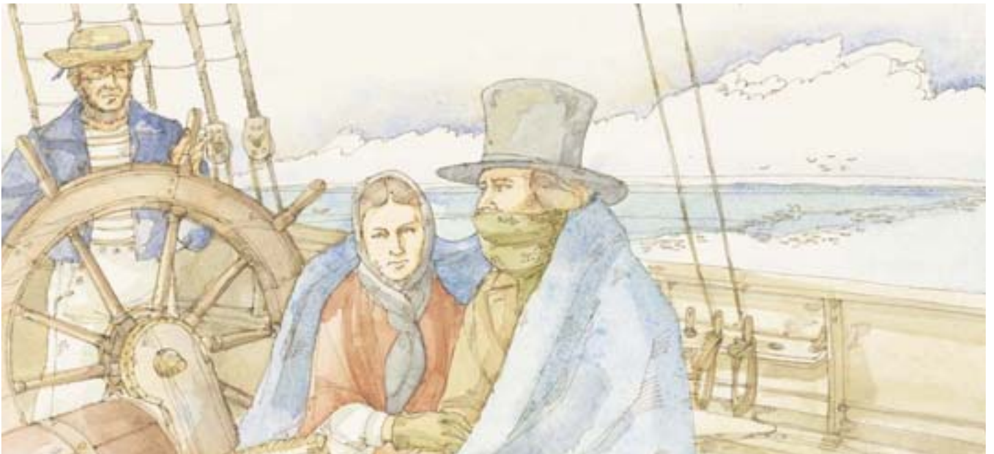
Many people who joined the Church were encouraged to gather with the Saints in the Great Salt Lake Valley. They made great sacrifices to leave their homes, sail