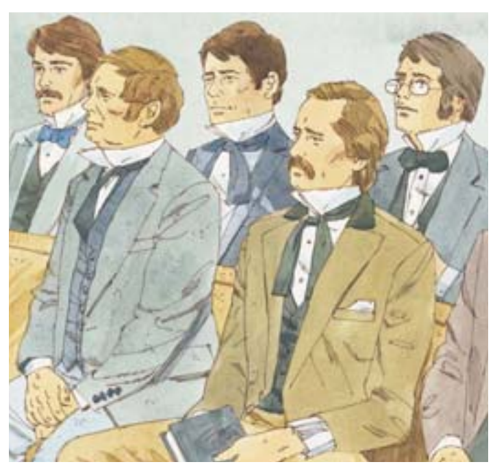
Men who are ordained elders also have the Melchizedek Priesthood. Elders are to teach Church members and watch over them.

Doctrine and Covenants 20:38-45; 43:15; 107:7, 11-12