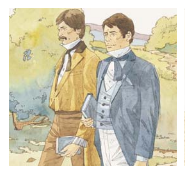
Elders are also called to go on missions to teach the gospel to people throughout the world.

Doctrine and Covenants 20:38-45; 43:15; 107:7, 11-12