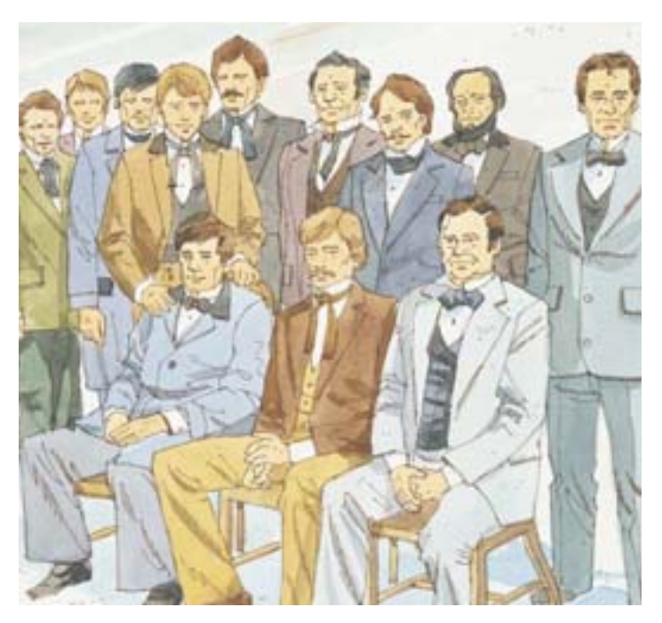
Apostles are very important leaders in the Church. They know that Jesus is our Savior. They teach the gospel all over the world.