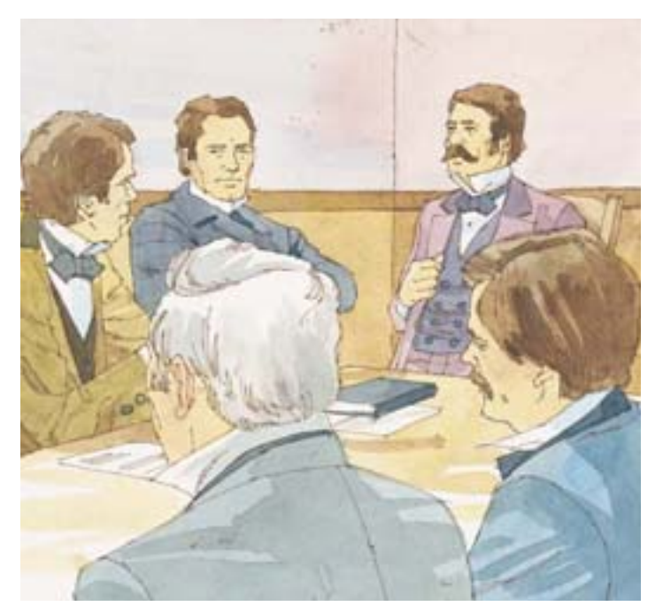
One day the Twelve Apostles were in a meeting. They were getting ready to go on missions, and they wanted Heavenly Father's help.