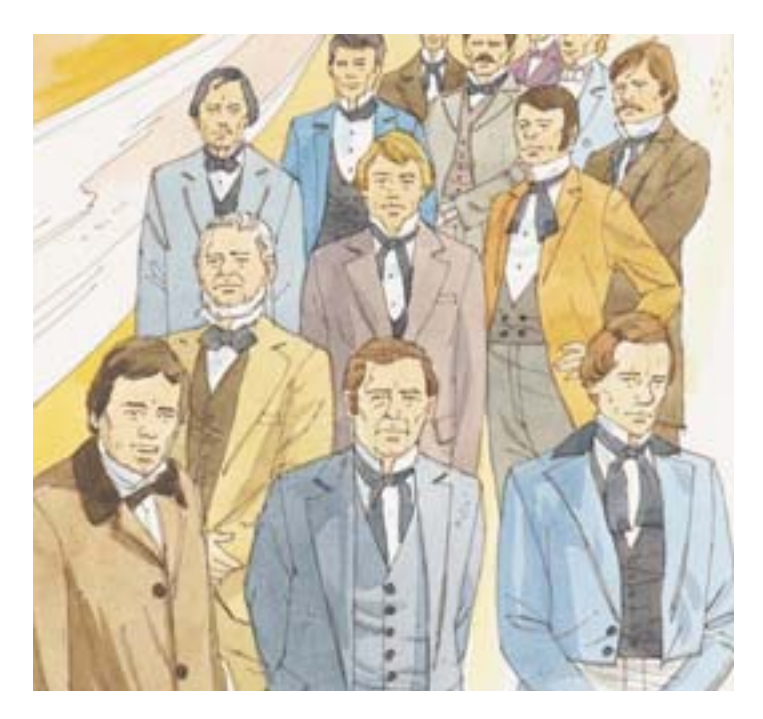
There are two priesthoods in the Church. One is the Melchizedek Priesthood, which is also called the greater priesthood. The President of the Church, his counselors, the Twelve Apostles, and the Seventy all have the Melchizedek Priesthood. Doctrine and Covenants 107:1, 22-26