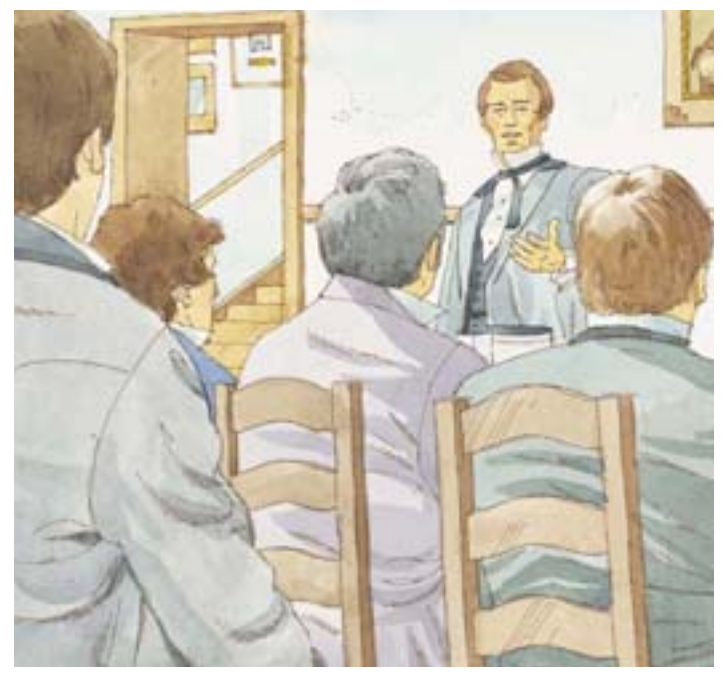
oseph Smith asked the men of Zion's Camp and others to come to an important meeting in Kirtland, Ohio. Joseph told the men that Jesus wanted twelve Apostles to be called to help lead the Church.