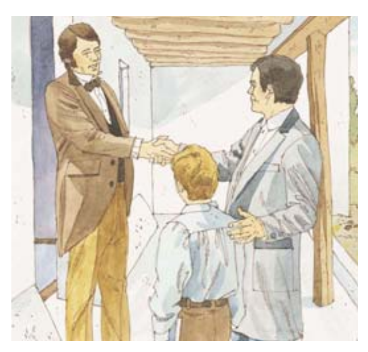
Teachers prepare the sacrament. They go home teaching and help members of the Church live good lives.