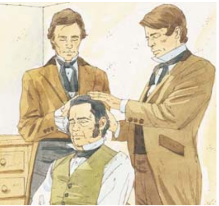
All men who have the Melchizedek Priesthood can bless people. They can also give people the Holy Ghost.

Doctrine and Covenants 20:43; 42:43-44; 107:18