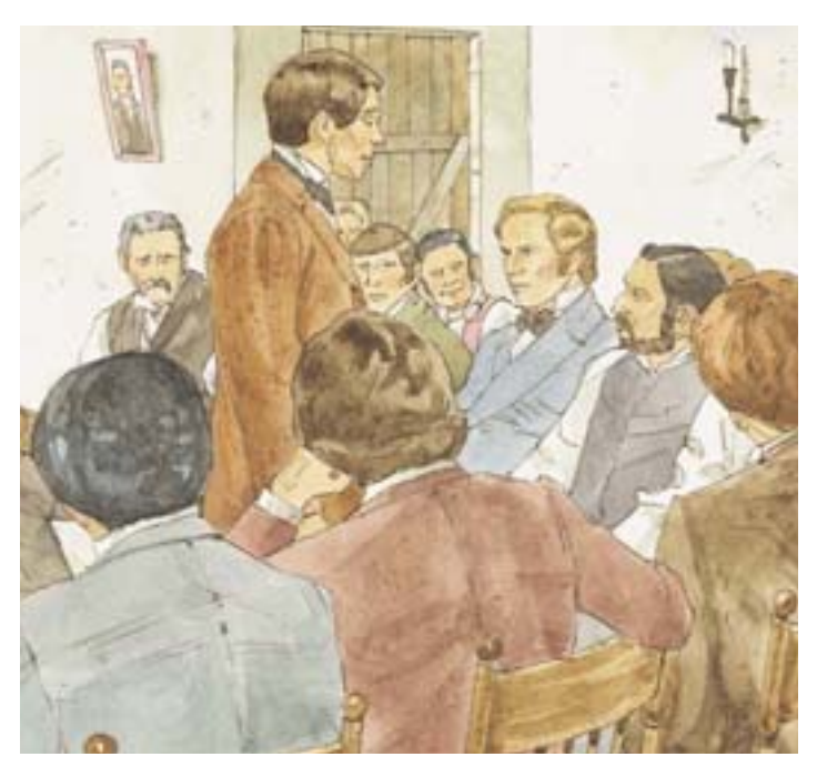
High priests also have the Melchizedek Priesthood. Many leaders in stakes and wards are high priests. These include stake presidents, bishops, and high councilors.