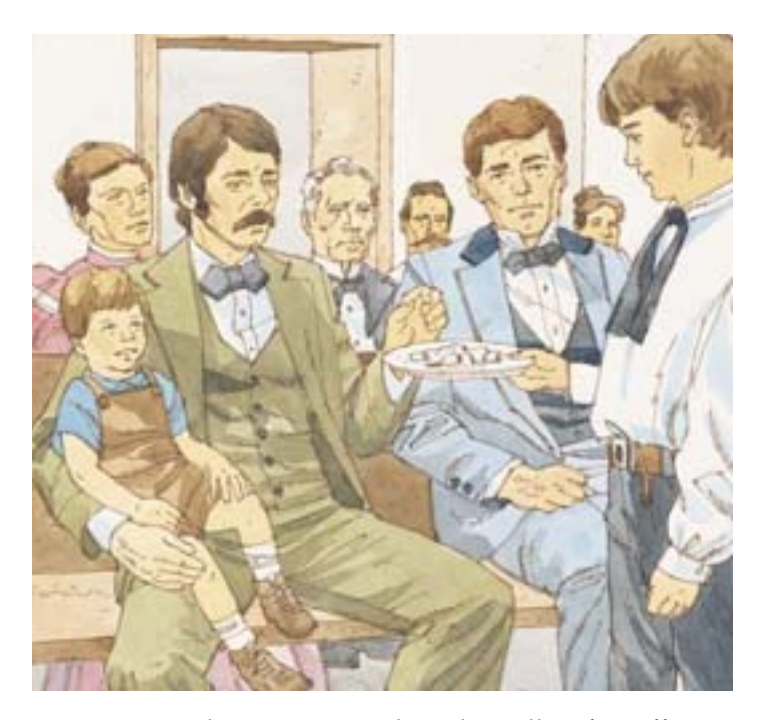
Deacons pass the sacrament. They also collect fast offerings and help the bishop.