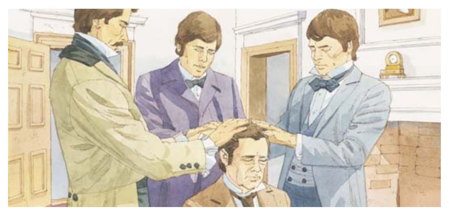
The priesthood is the power of God. It is the greatest power on earth. God gives the priesthood to righteous men. Men who hold the priesthood can be authorized