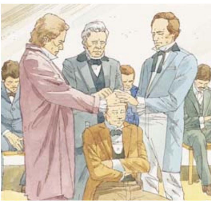
The twelve men were ordained Apostles. The calling of the Apostles was one of the most important events in the restoration of the Lord's Church.