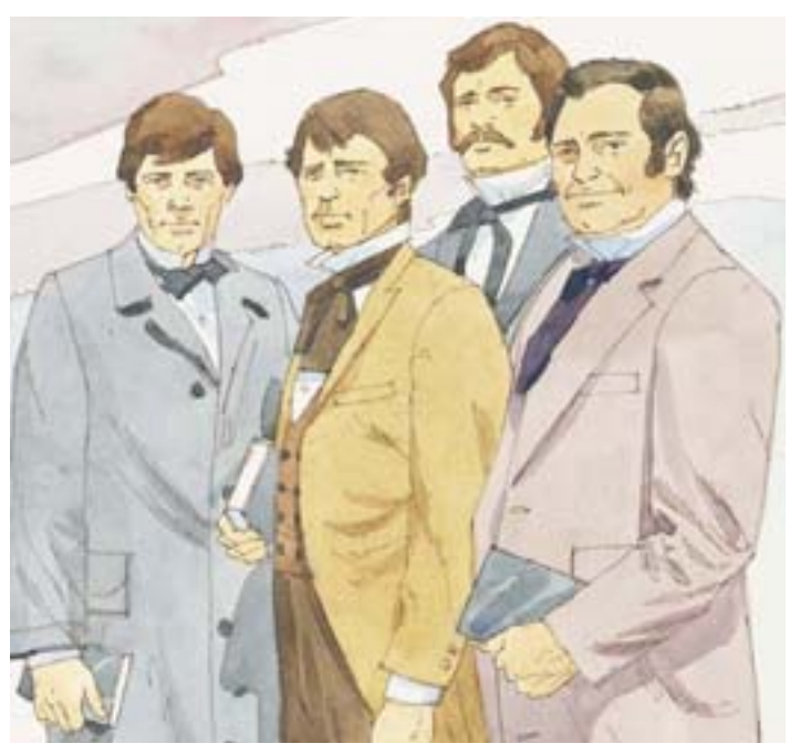
After a few days, other men were chosen to be leaders in the Church. They were called the Seventy. The Seventy help the Apostles.