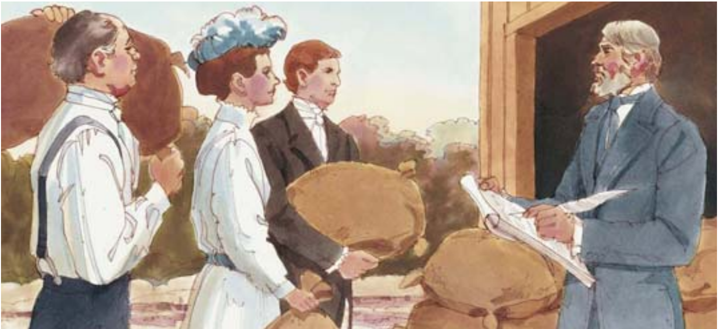
Joseph told Oliver about some revelations he had received. The Lord had revealed that the Saints should build a temple in Zion. The temple would be paid for by the tithing of the people. Jesus told Joseph that