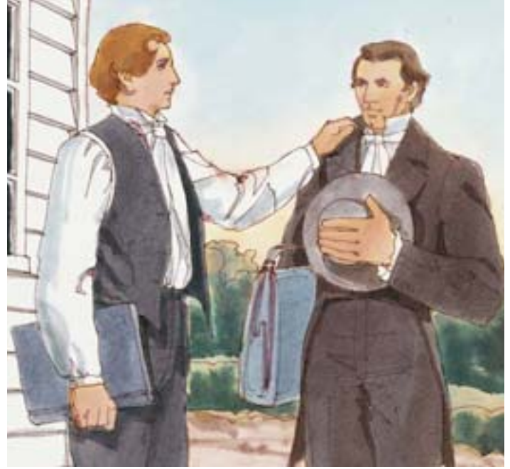
When Oliver arrived in Kirtland, he told Joseph what was happening in Jackson County. The Saints there wanted to know what they should do.