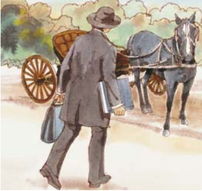
Oliver Cowdery was one of the leaders of the Church in Missouri. He was sent to Kirtland to see Joseph Smith.