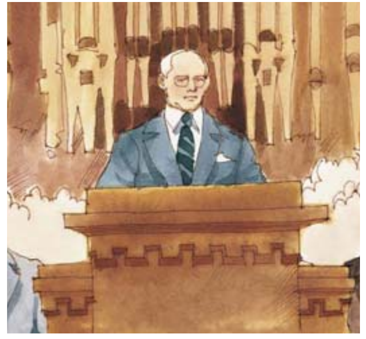
Today the living prophet is the leader of the Church. He and his counselors are the First Presidency of the Church.