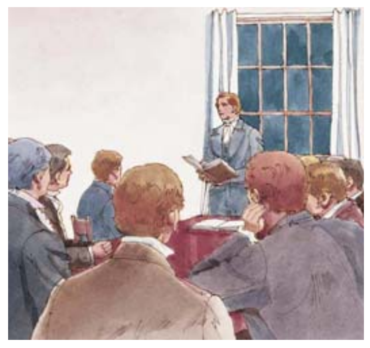
Jesus also told Joseph to choose twelve men to serve on a high council. High councilors hold the office of high priest in the Melchizedek Priesthood. One of their assignments is to help work out problems that might arise in the Church.