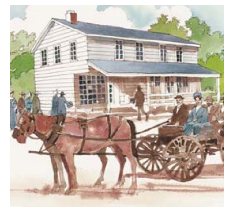
In February 1834, Joseph Smith organized the first stake of the Church. A stake is many members of the Church who live in the same area. All the Saints in Kirtland were in the first stake.