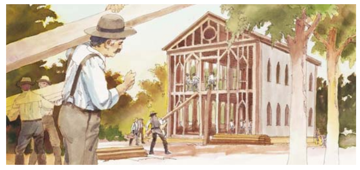
The Saints obeyed the Lord and started to build the Kirtland Temple. It was hard work, and all the Saints needed to help.