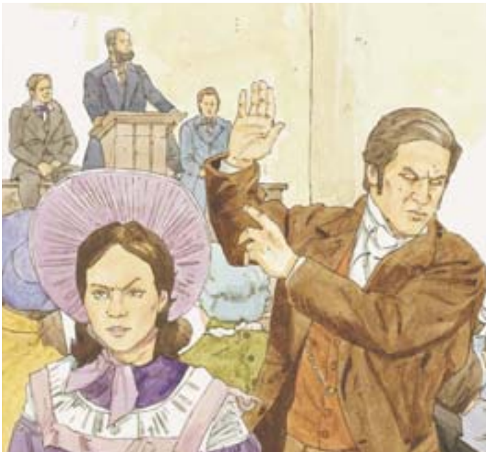
The people who will be with Satan learned about Jesus and His gospel while they were on earth. The Holy Ghost testified to them about Jesus Christ. They knew that He lived and that He died for us.