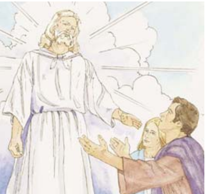
People in the terrestrial kingdom will see Jesus. But they cannot live with Heavenly Father and Jesus.