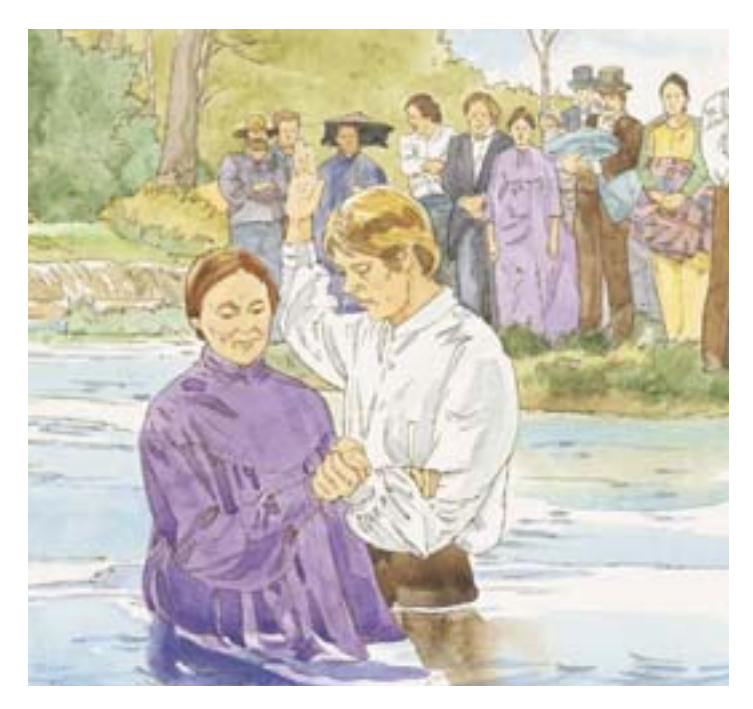
Those in the celestial kingdom believed in Jesus Christ during their time on earth. They were baptized and received the Holy Ghost.