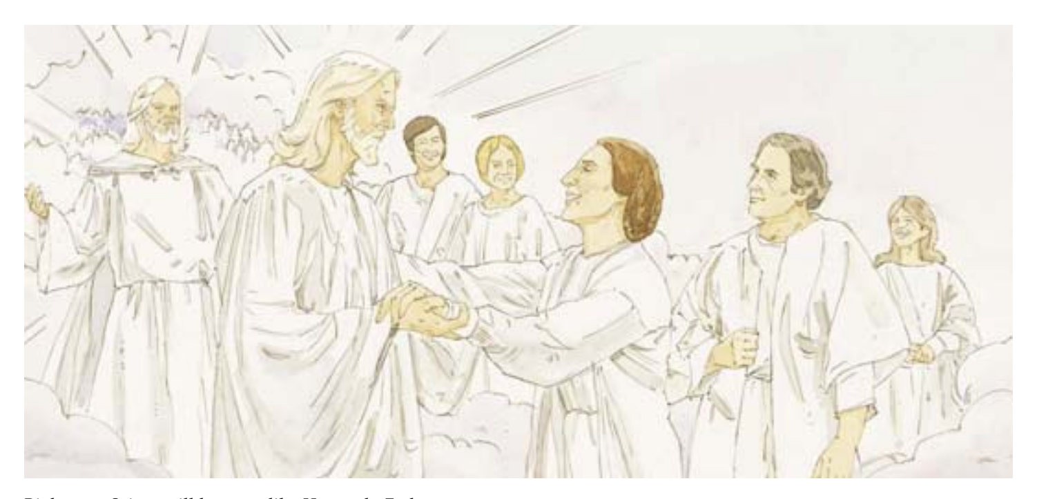
Righteous Saints will become like Heavenly Father and Jesus. All things will be theirs. They will live with Heavenly Father and Jesus forever.