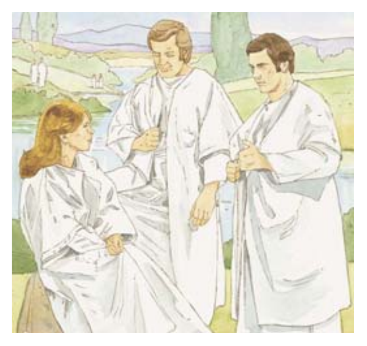
Next Joseph and Sidney saw the terrestrial kingdom of heaven. Doctrine and Covenants 76:71