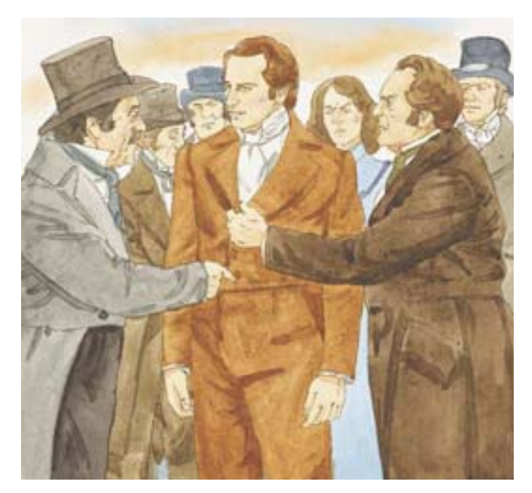
These people did not believe in Jesus or His gospel. They did not believe the prophets and did not obey God's commandments.

Doctrine and Covenants 76:81–82, 101, 103