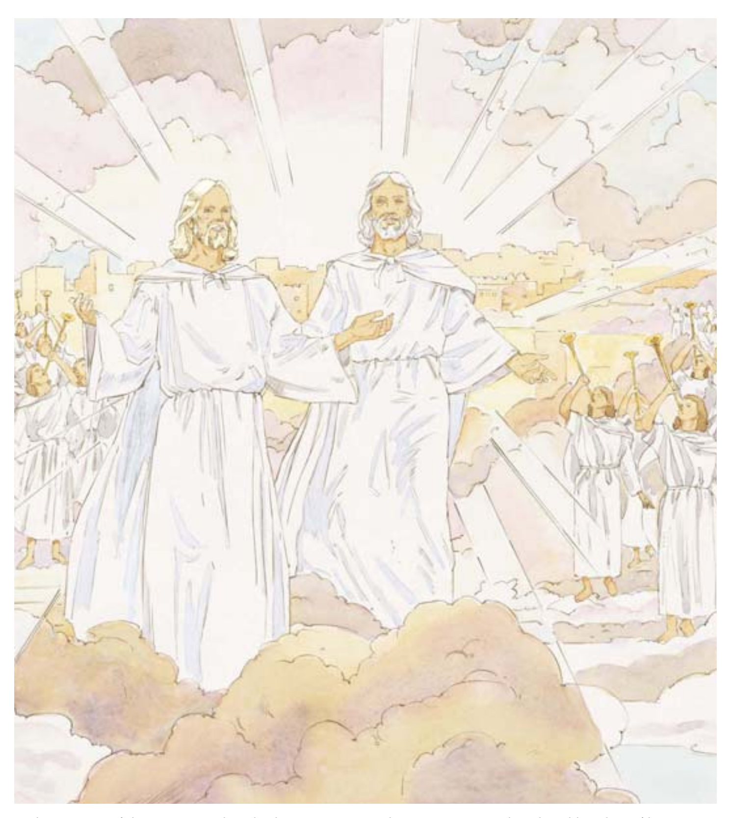
In the next part of the vision, Joseph and Sidney saw where people go after they are resurrected. There are three places, or kingdoms, for people to go in heaven.