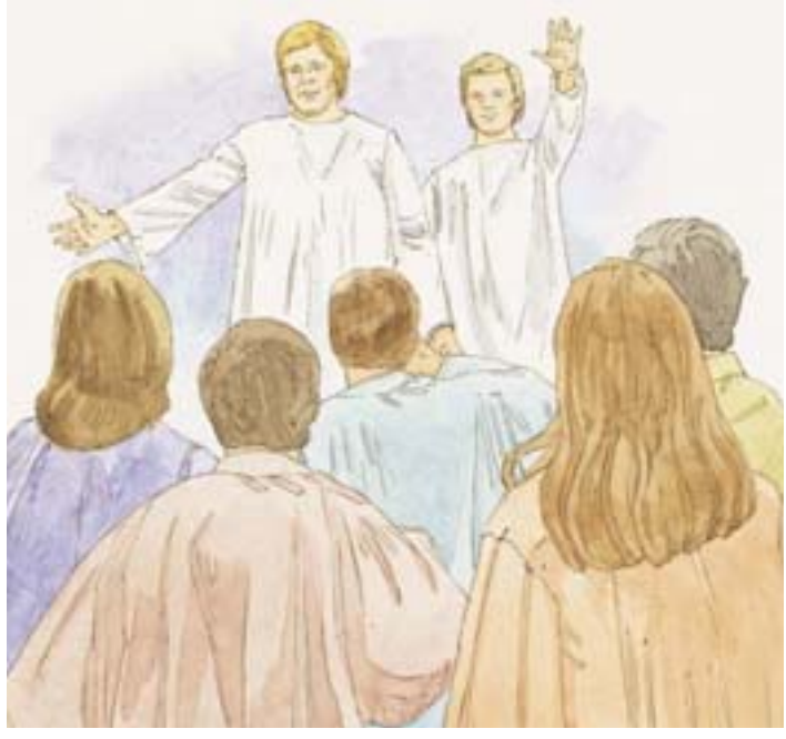
People in the telestial kingdom will not see Jesus or Heavenly Father and cannot live with Them. However, angels will visit these people, and the Holy Ghost will teach them.

Doctrine and Covenants 76:81–82, 101, 103