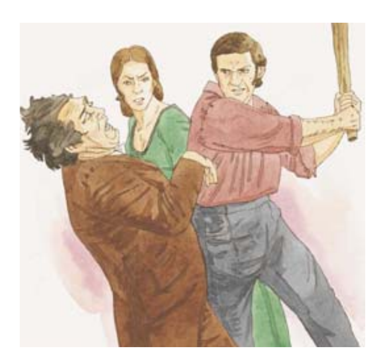
But then these people did very bad things. They denied the truth and defied God's power. They denied the Holy Ghost. They said they did not believe in Jesus anymore. These people will suffer forever.