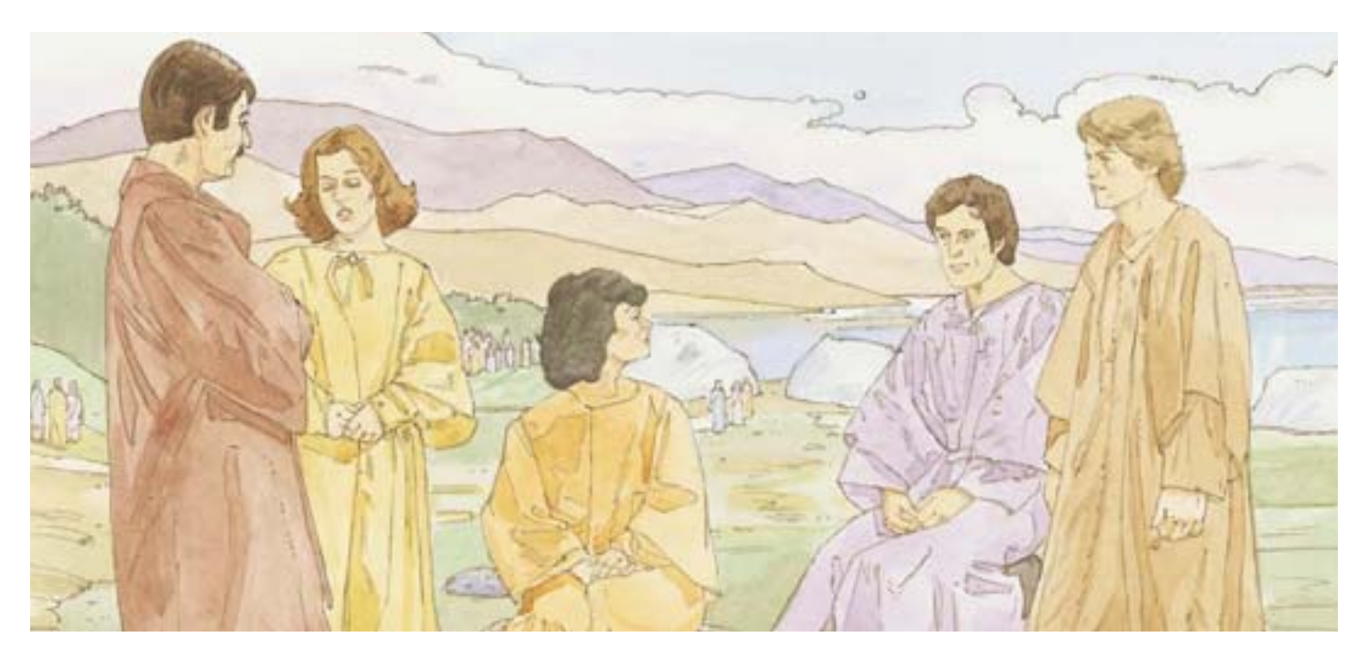
Next Joseph and Sidney saw the telestial kingdom of heaven. People who go to the telestial kingdom were not righteous on earth.