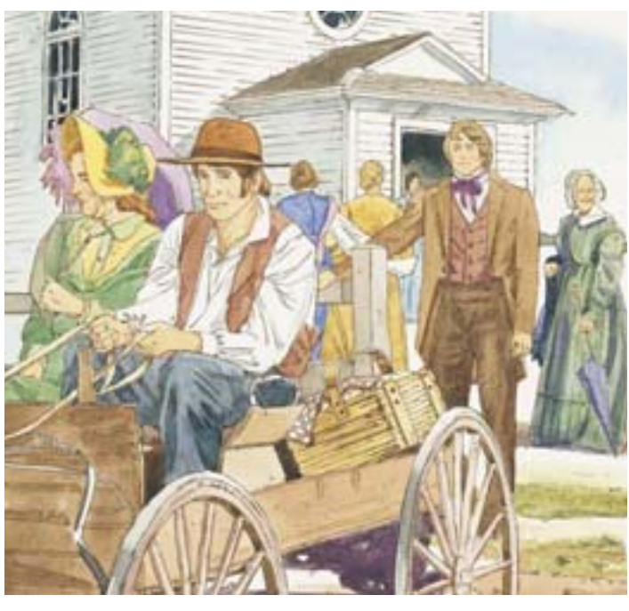
People in the terrestrial kingdom were good people on earth, but they were deceived by bad people. They obeyed some of the commandments but were not valiant in their testimonies of Jesus.