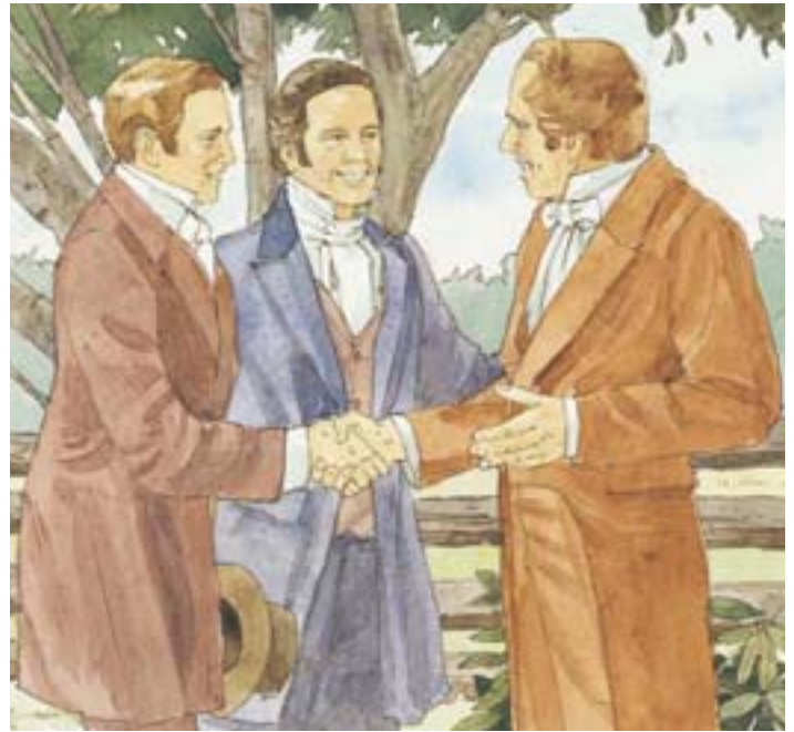
The missionaries from Kirtland also arrived in Jackson County.