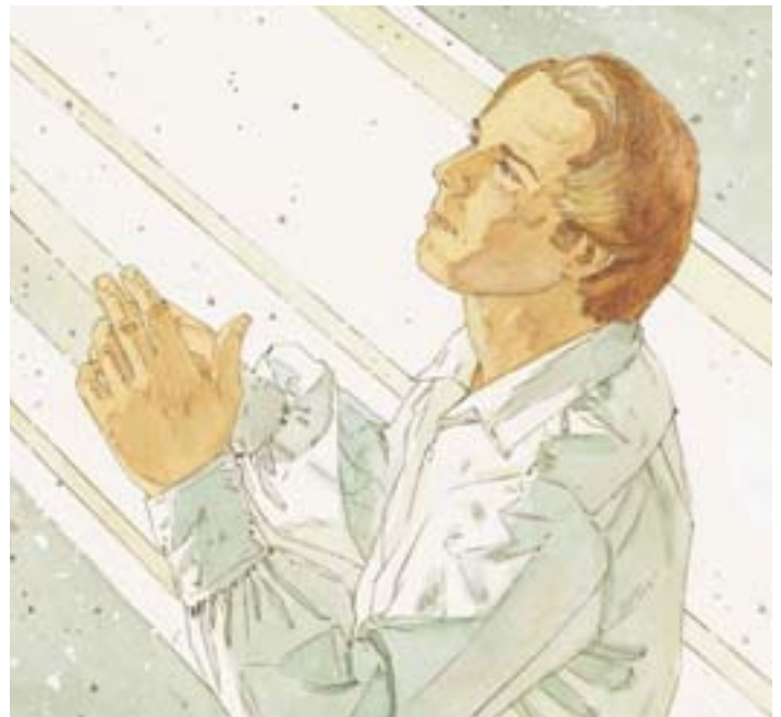
Joseph wanted to know where the city of Zion should be built. He prayed to Heavenly Father, and his prayer was answered.

Doctrine and Covenants 57, section heading