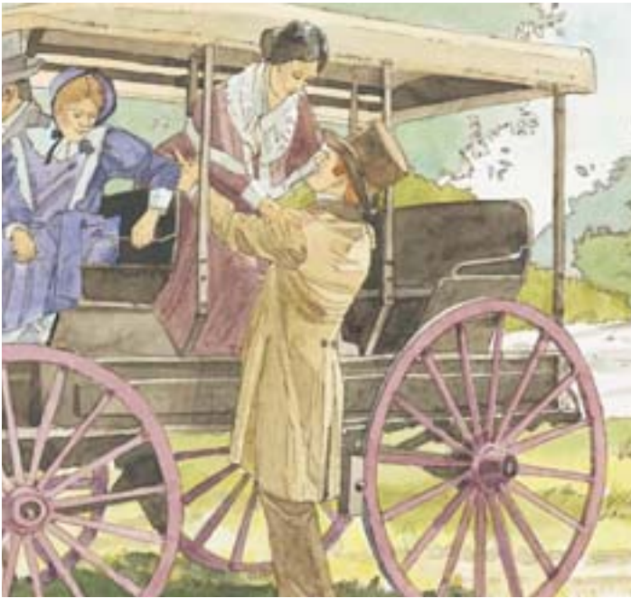
A few days after Joseph Smith and his friends arrived in Jackson County, the Saints from New York arrived there.