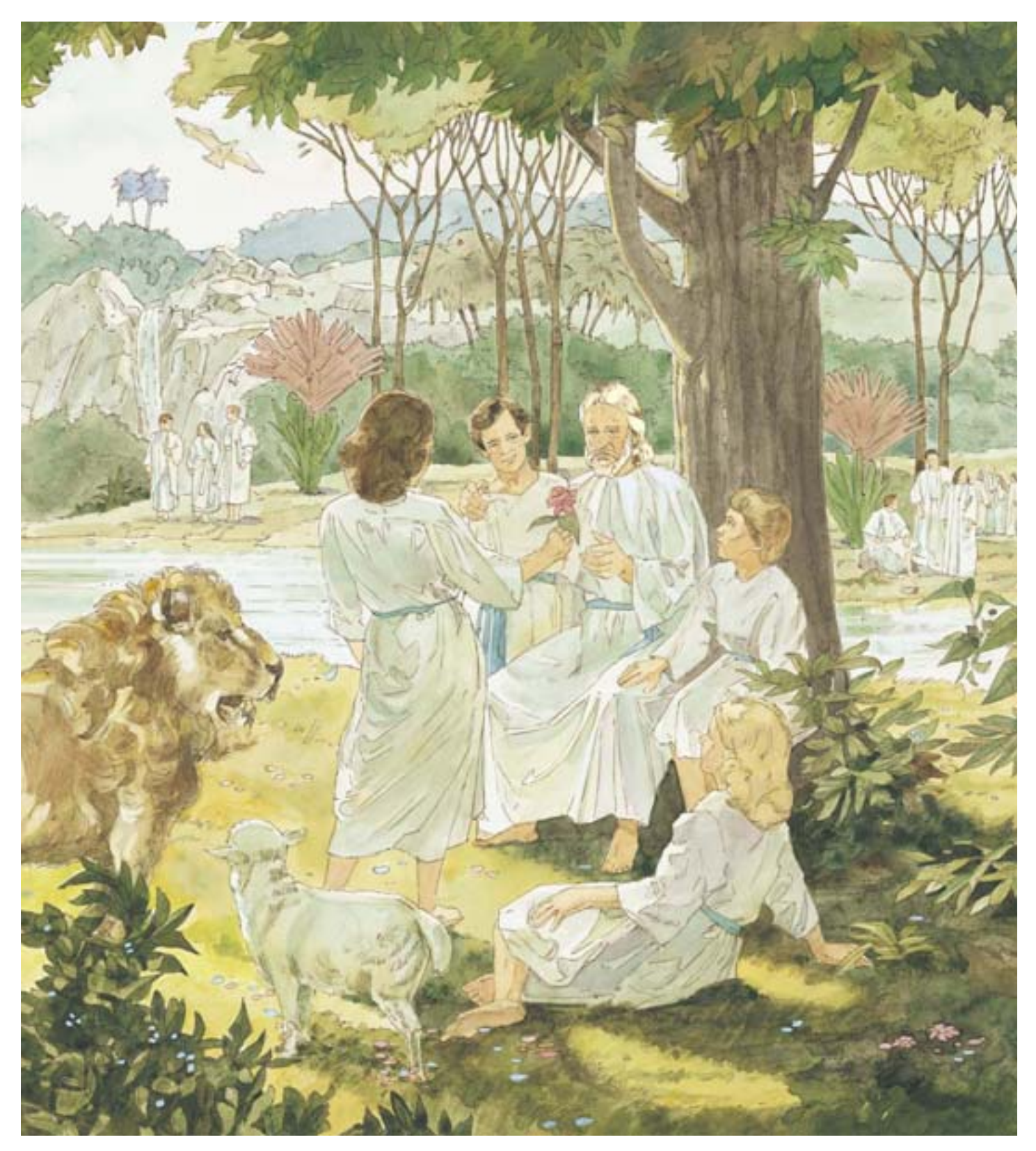
Righteous people will be very happy to see Jesus. The whole earth will belong to them. Satan will not be able to tempt them. Their children will grow up