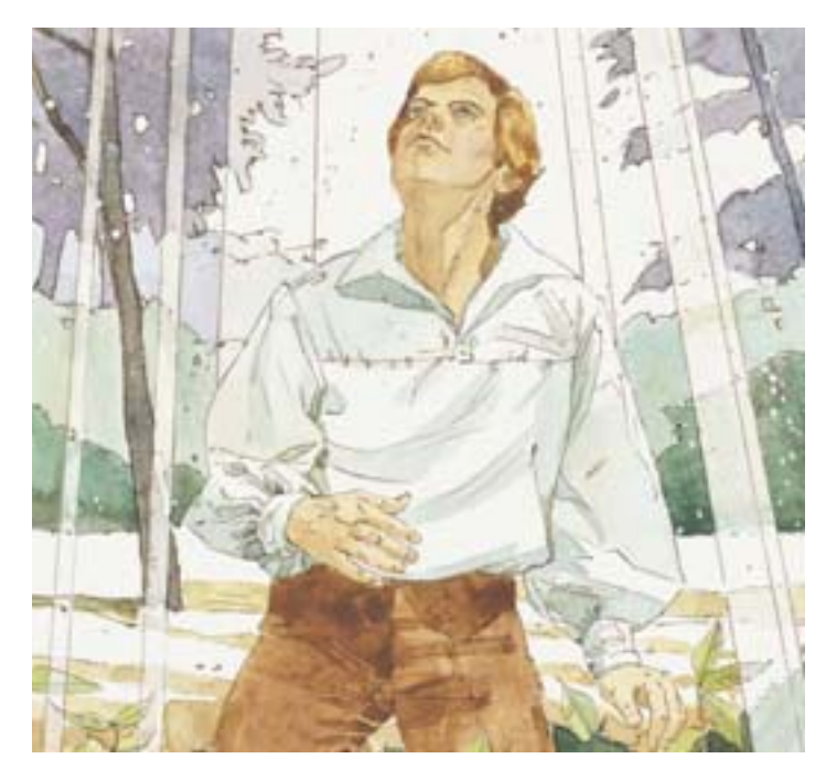
One important event in preparation for Jesus' return to the earth is the restoration of His Church. Jesus said the restored gospel would be like a light in the darkness.