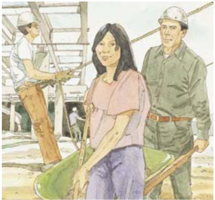
Righteous Saints will build the new city of Zion, where they will be safe. They will not fight with each other. They will be happy and sing songs of joy. People who are not righteous will not be able to go to Zion.