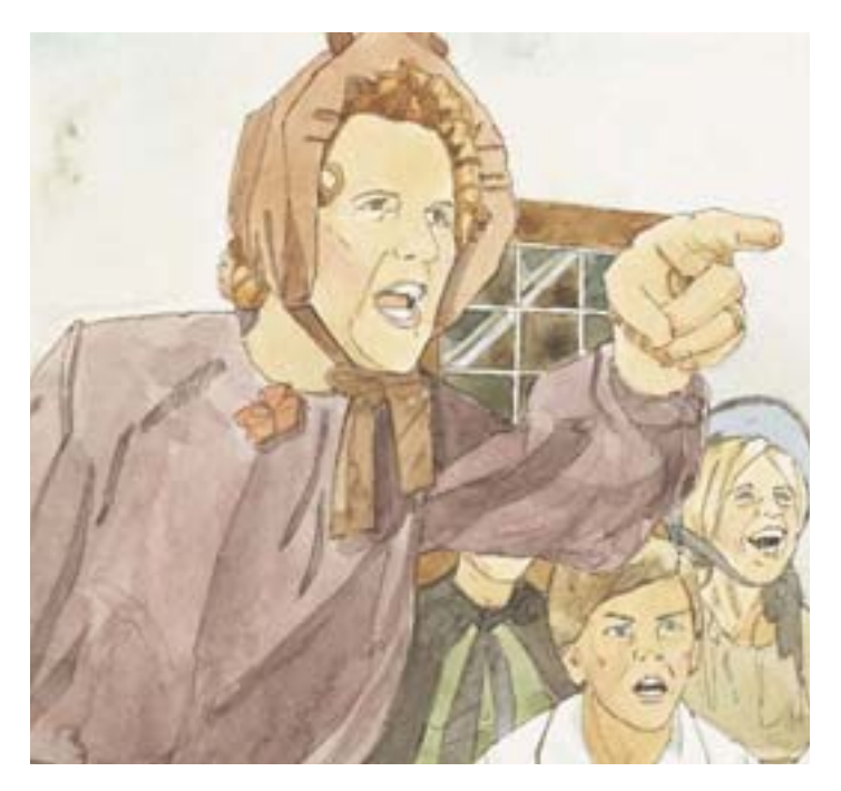
S ome people in Kirtland, Ohio, didn't want to learn the gospel. Some even told lies about the Saints to try to stop others from learning about the gospel.

Doctrine and Covenants 45, section heading