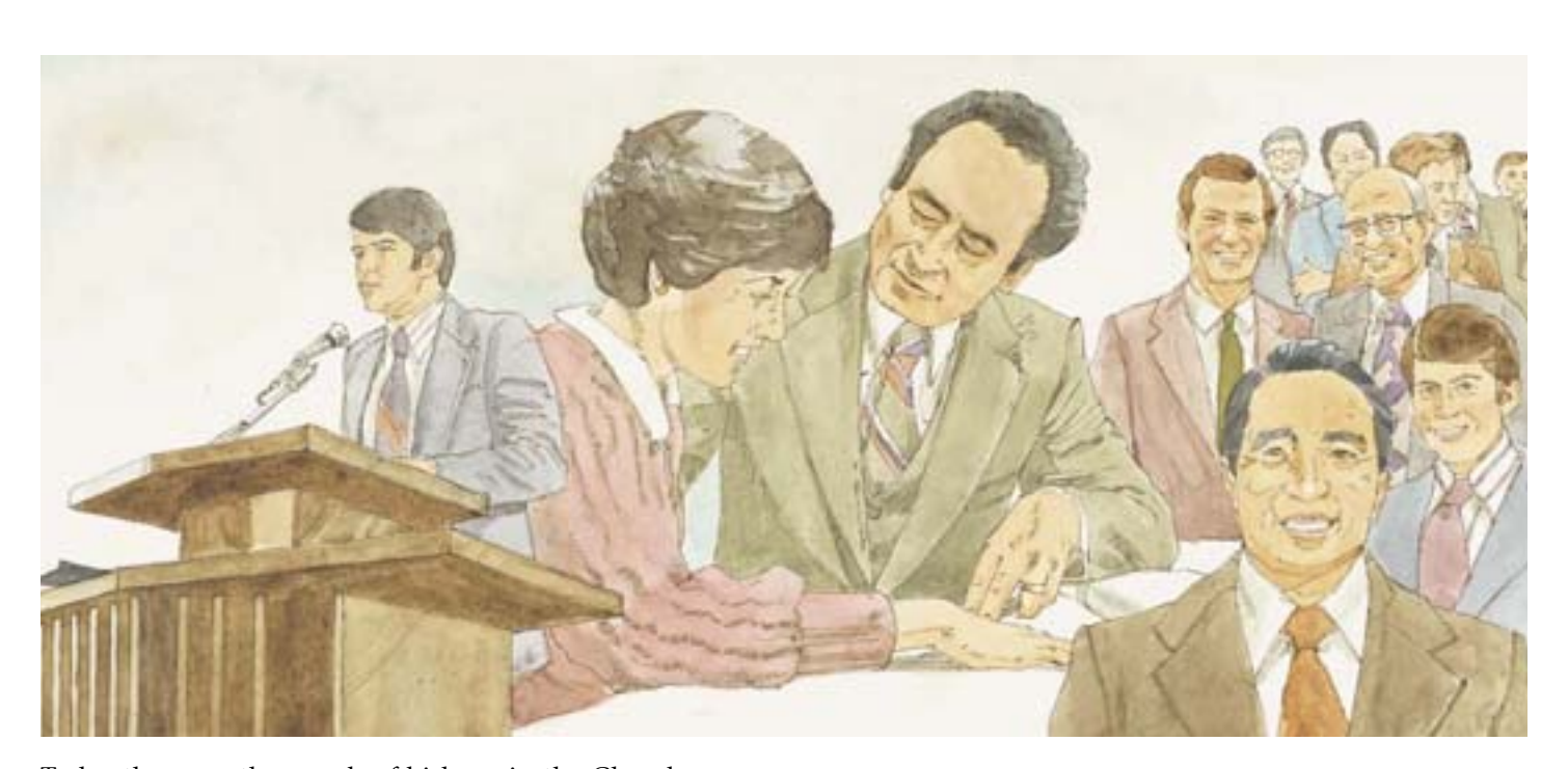
Today there are thousands of bishops in the Church.