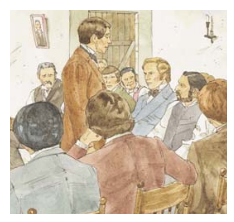
The bishop should love the Saints and try to help them. He should meet with the men who have the priesthood and talk about what they are doing to help the Saints.