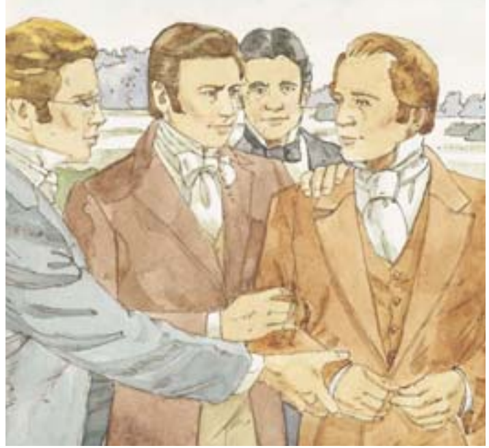
There were about 1,000 members of the Church in Kirtland. They were trying to obey God, but they did not understand all of the gospel.

Doctrine and Covenants 41, section heading