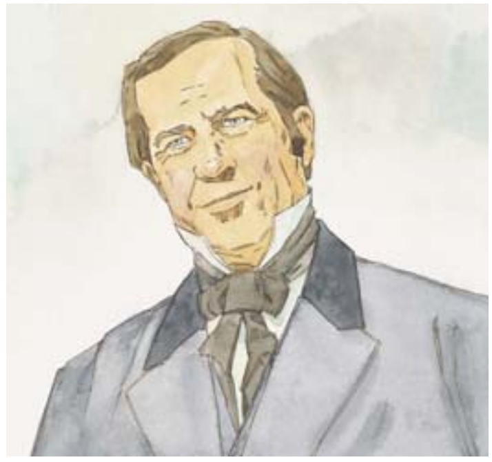
As more people joined the Church, more bishops were needed. Newel K. Whitney was called to be the second bishop of the Church. Doctrine and Covenants 72:7–8