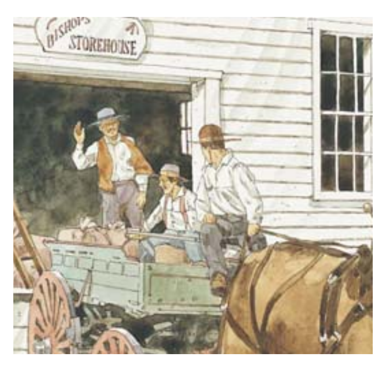
Jesus told Joseph that the bishop should take care of a storehouse. The Saints should give food, clothing, and other offerings to the bishop to place in the storehouse. Then the bishop would use these things to help any Saints who were poor or needy.