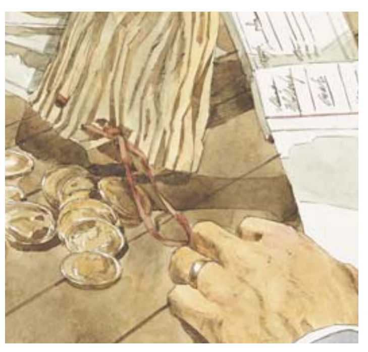
Jesus also said that the bishop should receive the money that the Saints give to the Church. The bishop would use this money to pay the bills of the Church and to help the poor.