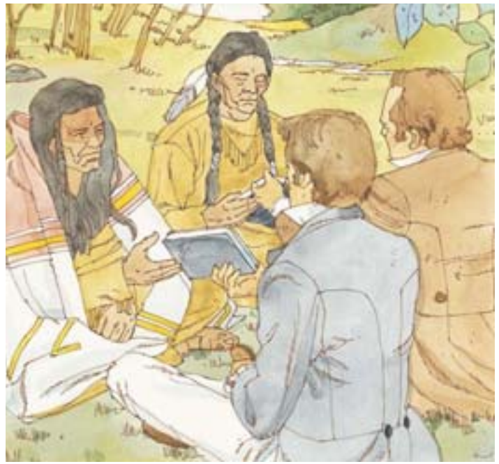
First the missionaries went to some tribes in New York. The missionaries gave the people the Book of Mormon, but only a few of them could read.