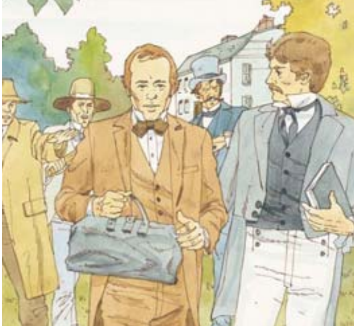
The people said soldiers would chase the missionaries away if they did not leave. Saddened, the missionaries went to teach other people in Missouri.