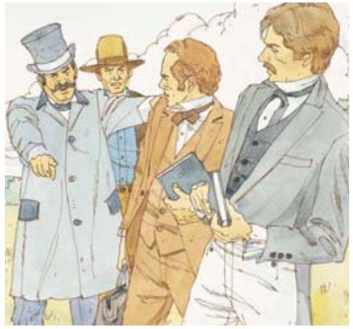
Other people in Missouri did not believe the restored gospel or the Book of Mormon. They told the missionaries to stay away from the Indians.