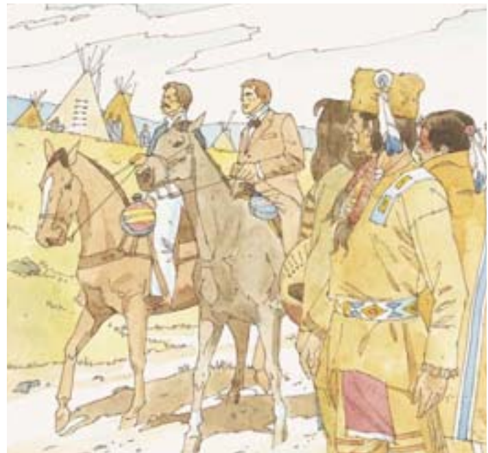
The missionaries left Ohio and went to a town named Independence in Jackson County, Missouri.