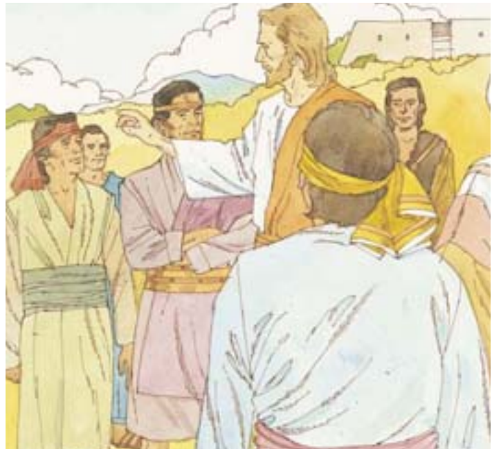
The Book of Mormon tells the Lamanites about their ancestors who lived hundreds of years ago. It tells them about important promises Jesus made to them. It helps them believe in Jesus. It teaches them to repent and be baptized.