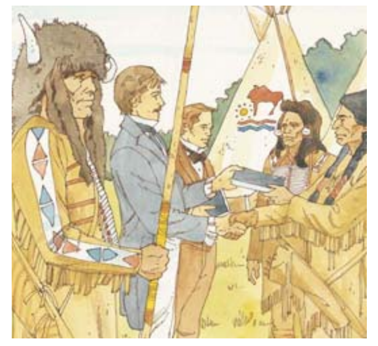
Then the missionaries went to preach to some Lamanites in Ohio. These people were happy to hear about the Book of Mormon and learn about their ancestors.