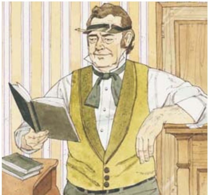
The people who tried to stop the printing did not succeed because those who are wicked cannot stop Jesus' work. After many months, the printing of the Book of Mormon was completed.