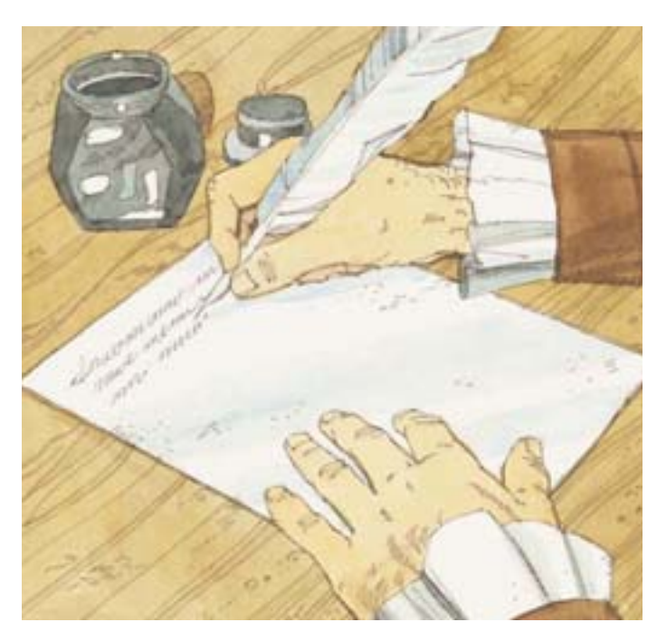
All the witnesses wrote about the gold plates. They said they had seen the plates, and they testified that the plates were real. The words of the witnesses are in the Book of Mormon.