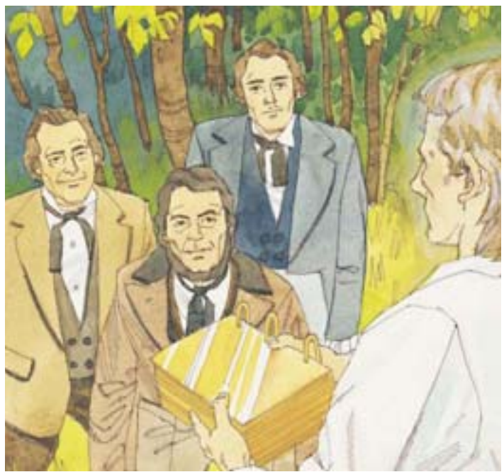
Joseph took the three witnesses into the woods, where they prayed. An angel came and showed them the gold plates. Jesus told the three witnesses to tell people what they had seen.

Doctrine and Covenants 17:3, 5 "The Testimony of Three Witnesses" (see the introductory pages of the Book of Mormon)