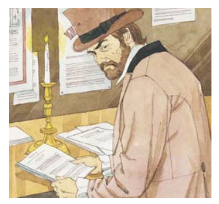
One man went to the printing shop on Sundays and stole some pages of the Book of Mormon. He printed the pages in a newspaper until other men made him stop stealing them.