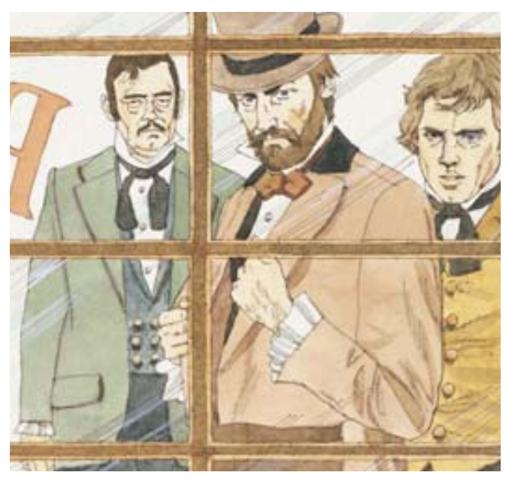
Satan did not want the Book of Mormon to be printed. He did not want people to read it. Wicked men tried to stop the printer.